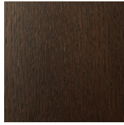
DARK SMOKED OAK