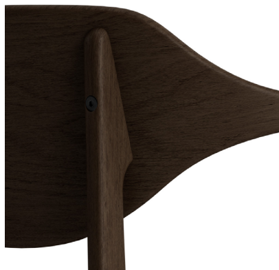
DARK SMOKED OAK BARNUM BOUCLE COL 3