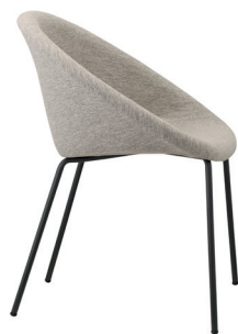
2685 VA T6 28

Poltrona con scocca imbottita e anima in tecnopolimero. Struttura a 4 gambe in acciaio tubolare \varnothing mm 16 verniciato antracite. Giulia Pop è adatta a tutti gli ambienti dalla casa al contract. Rivestimento in tessuto non sfoderabile. Per uso interno.