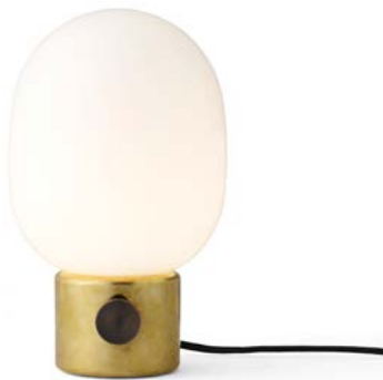
Mirror Polished Brass 1800839