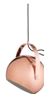
Glossy copper ø19 cm: Art.no. 100316