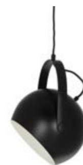
Matt black ø19 cm: art.no. 100319