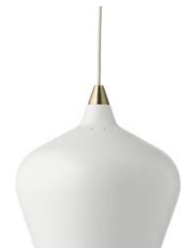
ø16 cm. matt white: art.no. 100413 ø25 cm. matt white: art.no. 100432 ø32 cm. matt white: art.no. 100443 Brass top. White fabric cord