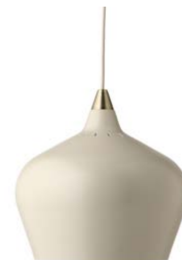
ø16 cm. matt taupe: art.no. 100415 ø25 cm. matt taupe: art.no. 100418 ø32 cm. matt taupe: art.no. 100445 Brass top. Taupe fabric cord