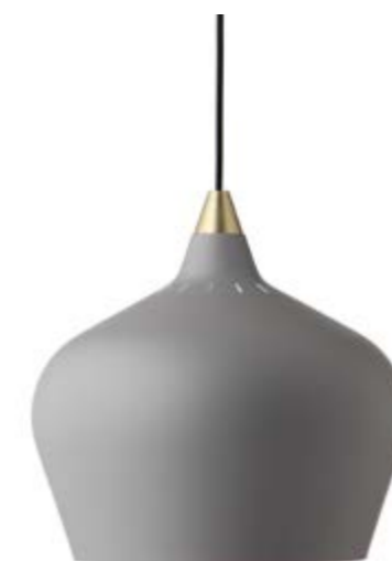
ø16 cm. matt grey: art.no. 100408 ø25 cm. matt grey: art.no. 100423 ø32 cm. matt grey: art.no. 100436 Brass top. Black fabric cord