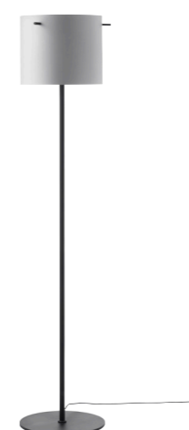
Item Number: 130271