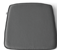
Outdoor, Dark Grey 9585150