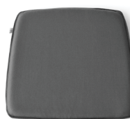
Outdoor, Dark Grey 9586150