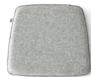
Indoor, Light Grey 9575130