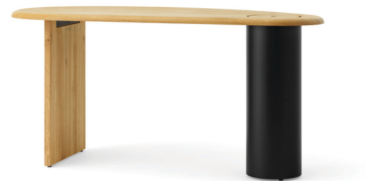
Natural Oiled Oak 1020039