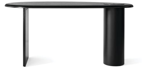
Dark Oiled Oak 1020889