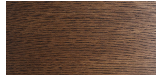
DARK STAINED OAK