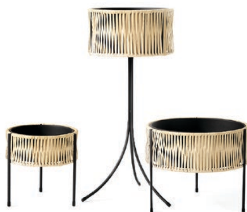
Umanoff Planter, 27, Black / Rattan, by Arthur Umanoff Umanoff Planter, 69, Black / Rattan, by Arthur Umanoff Umanoff Planter, 32,5, Black / Rattan, by Arthur Umanoff

Offered in three different sizes, the Umanoff Planter marries sleek powder coated steel lines with curved handwoven rattan for a natural contrast. Designed in 1961 by the late Arthur Umanoff, a master of mid-century modern, the elevated planter is suitable for both indoor and outdoor use.