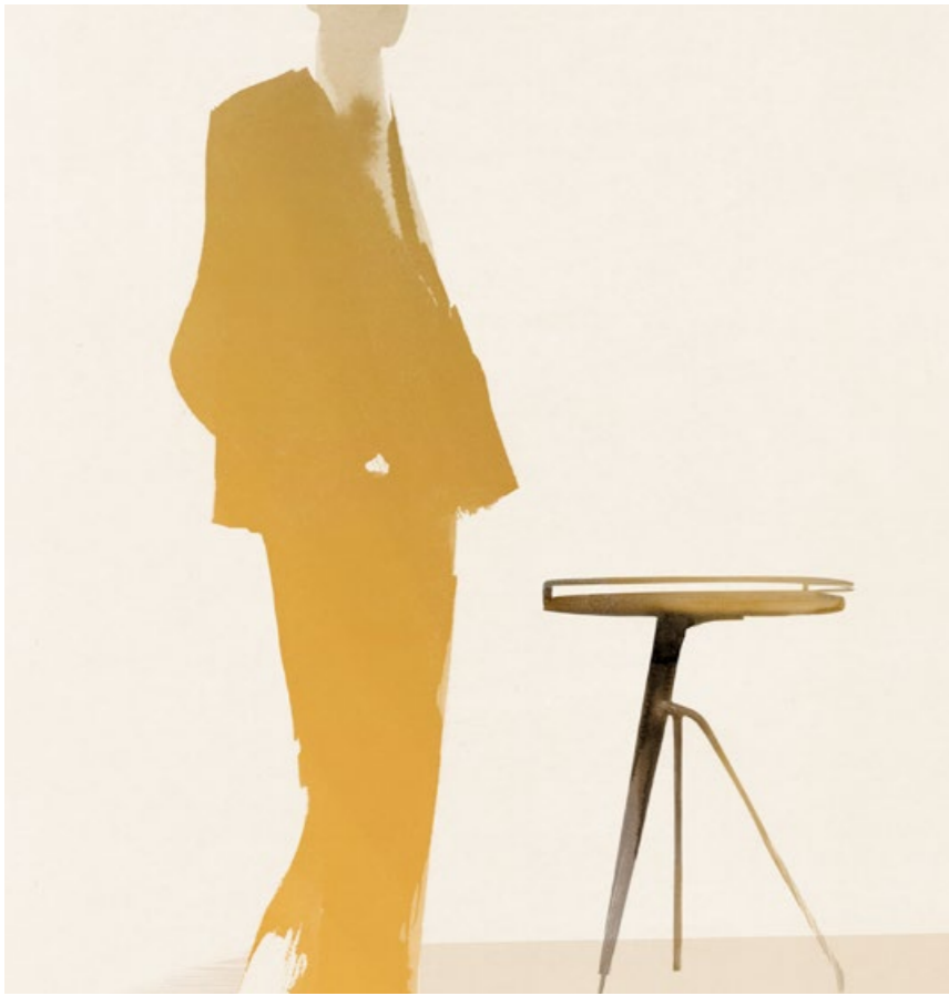
Artwork of Umanoff Side Table