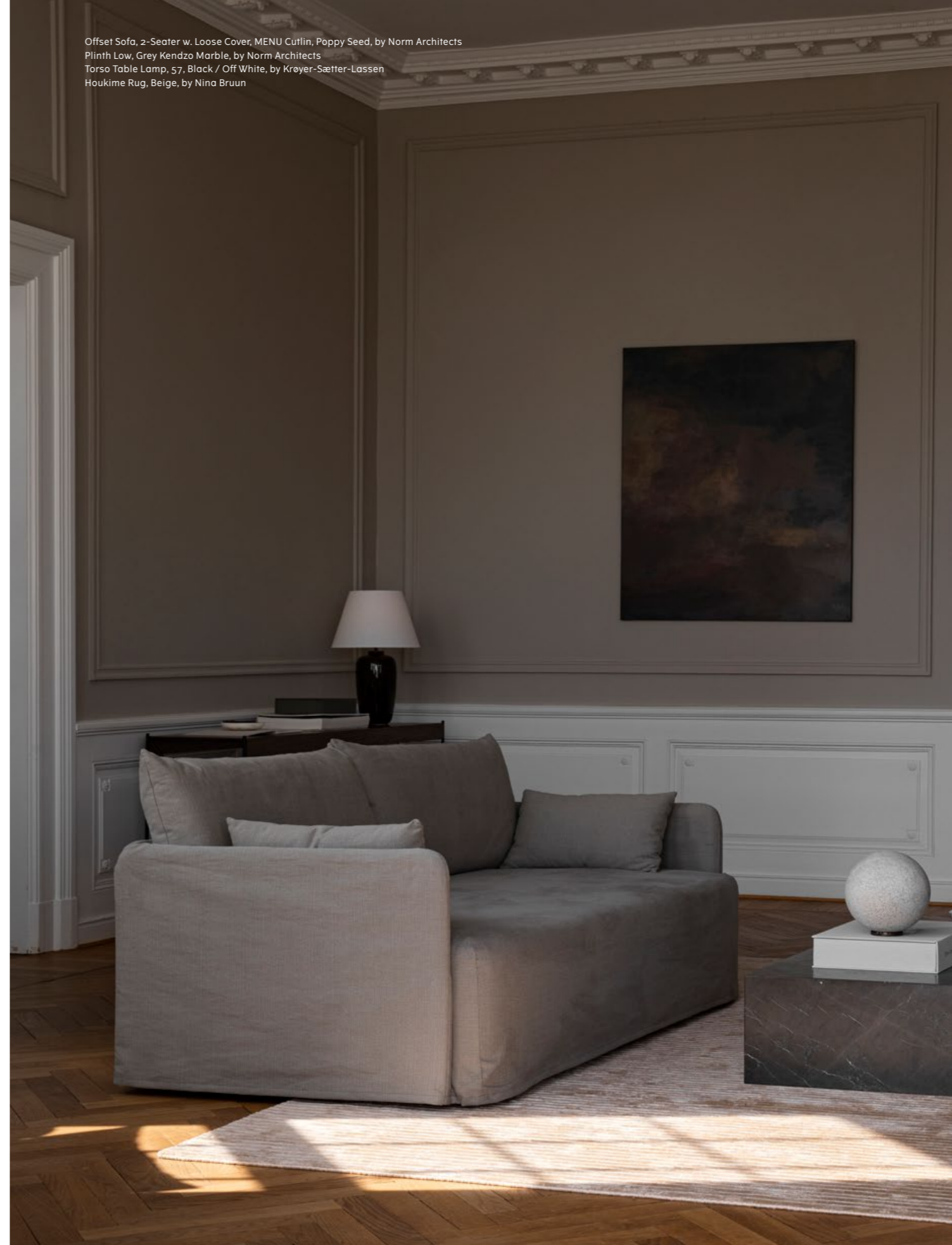
Offset Sofa, 2-Seater w. Loose Cover, MENU Cutlin, Poppy Seed, by Norm Architects Plinth Low, Grey Kendzo Marble, by Norm Architects Torso Table Lamp, 57, Black / Off White, by Krøyer-Sætter-Lassen Houkime Rug, Beige, by Nina Bruun