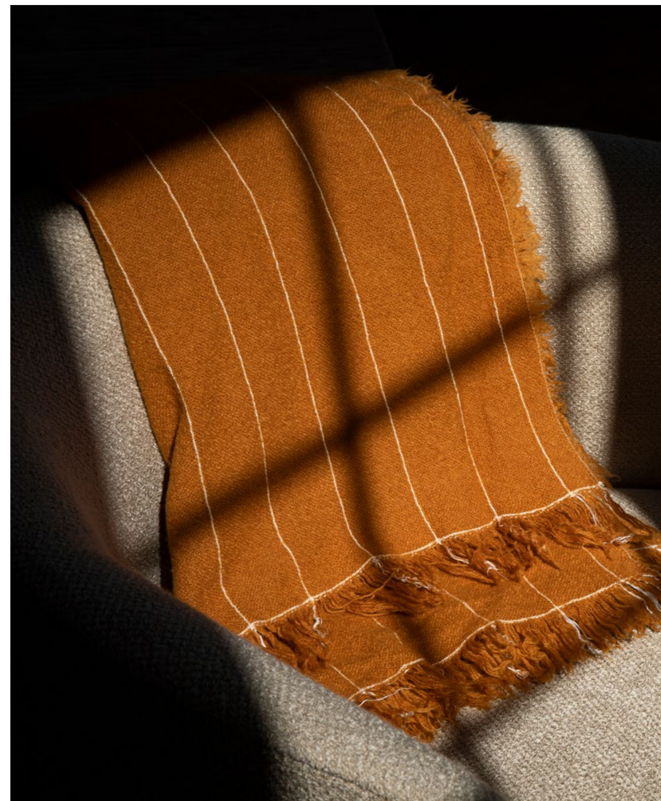
Battus Throw, Ivory, by Mentze Ottenstein + Rosholm

How have you approached responsible design, sourcing and production? Marie-Louise Rosholm: I wanted to use local European suppliers and focus on mono materials for a simple recycling process. By using cellulosic materials sewn with cotton thread and labels, the entire cushion – bar the metal zip – is fully recyclable. Inner cushions are made from recycled PET bottles. Both material and production process are transparent and traceable. Most of all, our focus has been on longevity in terms of design, colours and materials. Longevity is the most sustainable action we can take.