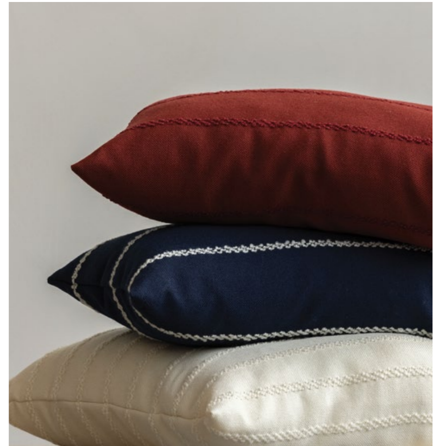
Battus Throw, Ochre, by Mentze Ottenstein + Rosholm Mimoides Pillow, 40x40, Birch, by Mentze Ottebstein + Rosholm Mimoides Pillow, 60 x 60, Birch, by Mentze Ottenstein + Rosholm Losaria Pillow, 60 x 40, Ivory, by Mentze Ottenstein + Rosholm Losaria Pillow, 60 x 60, Ochre, by Mentze Ottenstein + Rosholm Offset Sofa, 3-Seater w. Loose Cover, MENU Cutlin, Poppy Seed, by Norm Architects