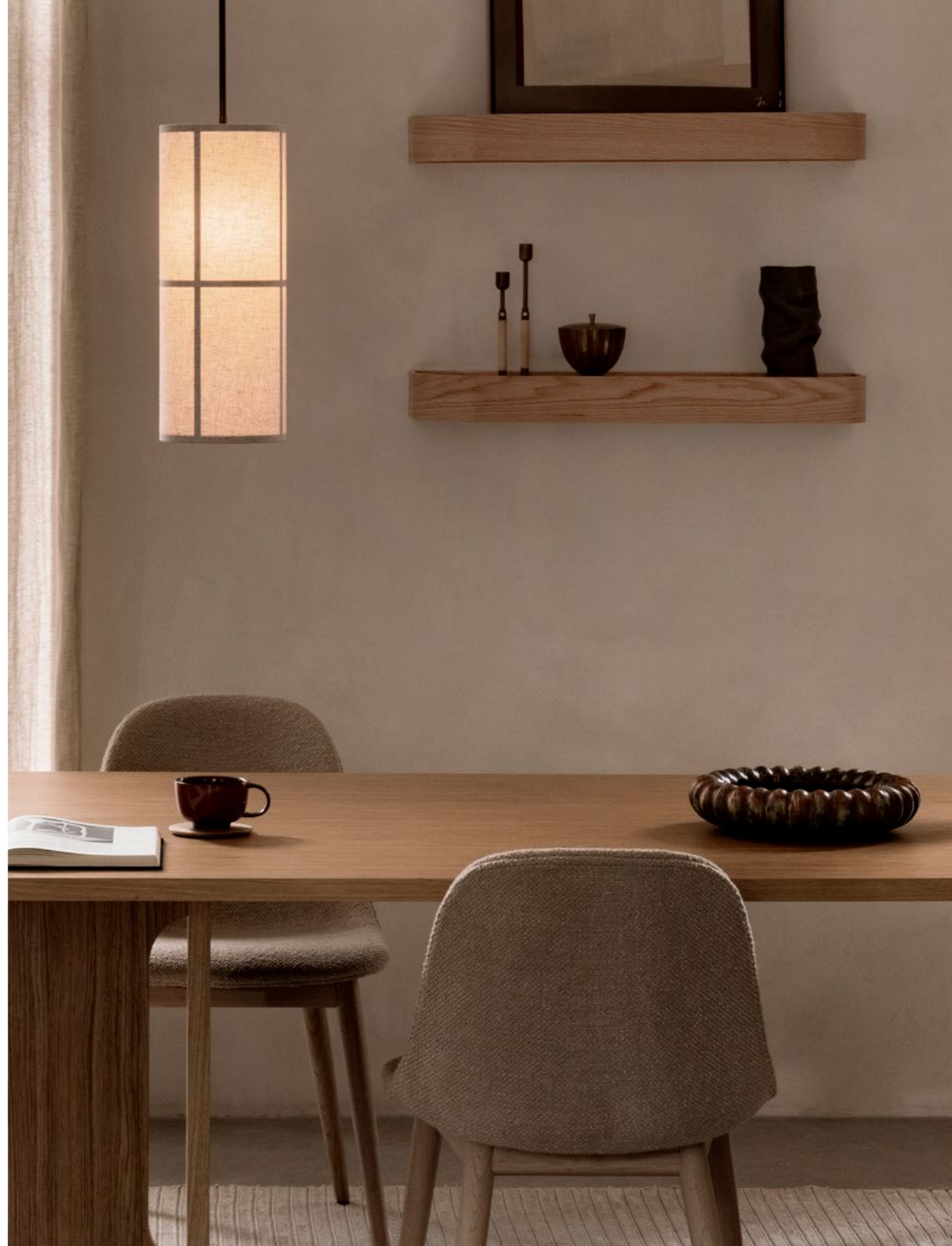
Hashira Pendant, Ø18, Raw, by Norm Architects Duca Candle Holder, Bronzed Brass, by Krøyer-Sætter-Lassen NNDW, Red Glazed, by Norm Architects Androgyne Dining Table, Rectangular 210 x 100, Natural Oak, by Danielle Siggerud Harbour Dining Side Chair, Natural Oak / Bouclé 02, by Norm Architects