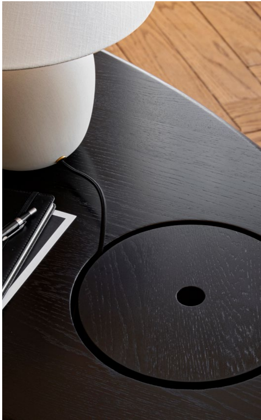
The Eclipse Desk, by Fred Rigby Studio Torso Table Lamp, 37, Sand / Off White, by Krøyer-Sætter-Lassen