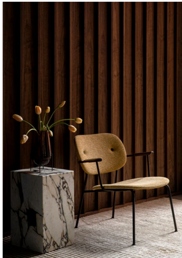
Co Chair w/ Armrest, Black Steel / Black Oak / Icon 246, by Norm Architects & Els Van Hoorebeeck

Drawing on The Office Group's extensive knowledge of workplace needs, the Co Chair pairs a lightweight, sleek profile with great seating comfort – and the option to stack up to 12 to 15 chairs in a compact tower. Aesthetically, the design's contoured form and warm materials bring Norm Architects' signature, human-centered minimalism to residential and hospitality applications. The design's versatility is the result of a thoughtful construction and a wide array of materials: with numerous veneer finishes and upholstery options to choose from, the Co Chair is easy to customize to create the desired expression and experience.