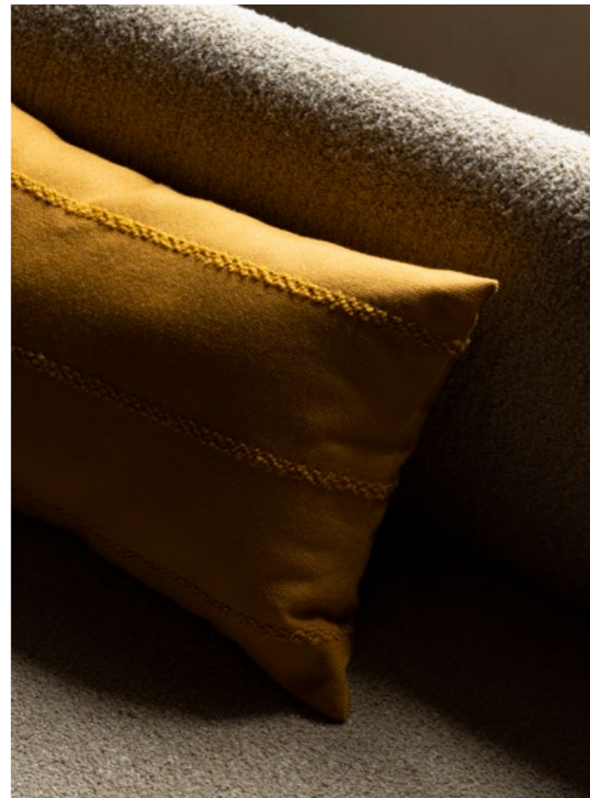
Losaria Pillow, 60 x 40, Ochre, by Mentze Offenstien + Rosholm