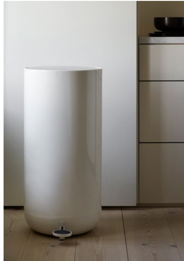
Pedal Bin, 30 L, White, by Norm Architects