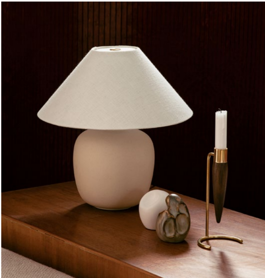
Umanoff Candle Holder, Walnut / Polished Brass, by Arthur Umanoff Torso Table Lamp, 37, Sand / Off White, by Krøyer-Sætter-Lassen