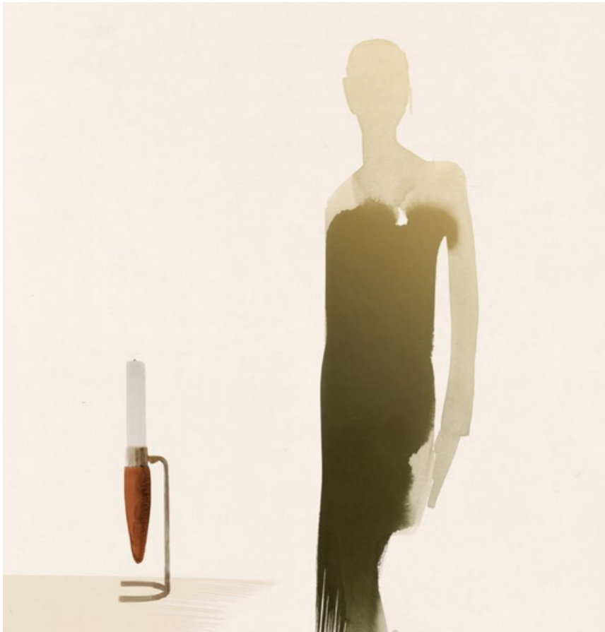
Artwork of Umanoff Candle Holder