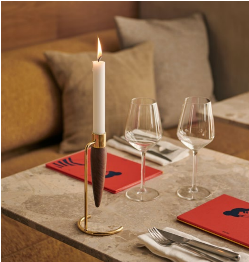
Umanoff Candle Holder, Walnut / Polished Brass, by Arthur Umanoff