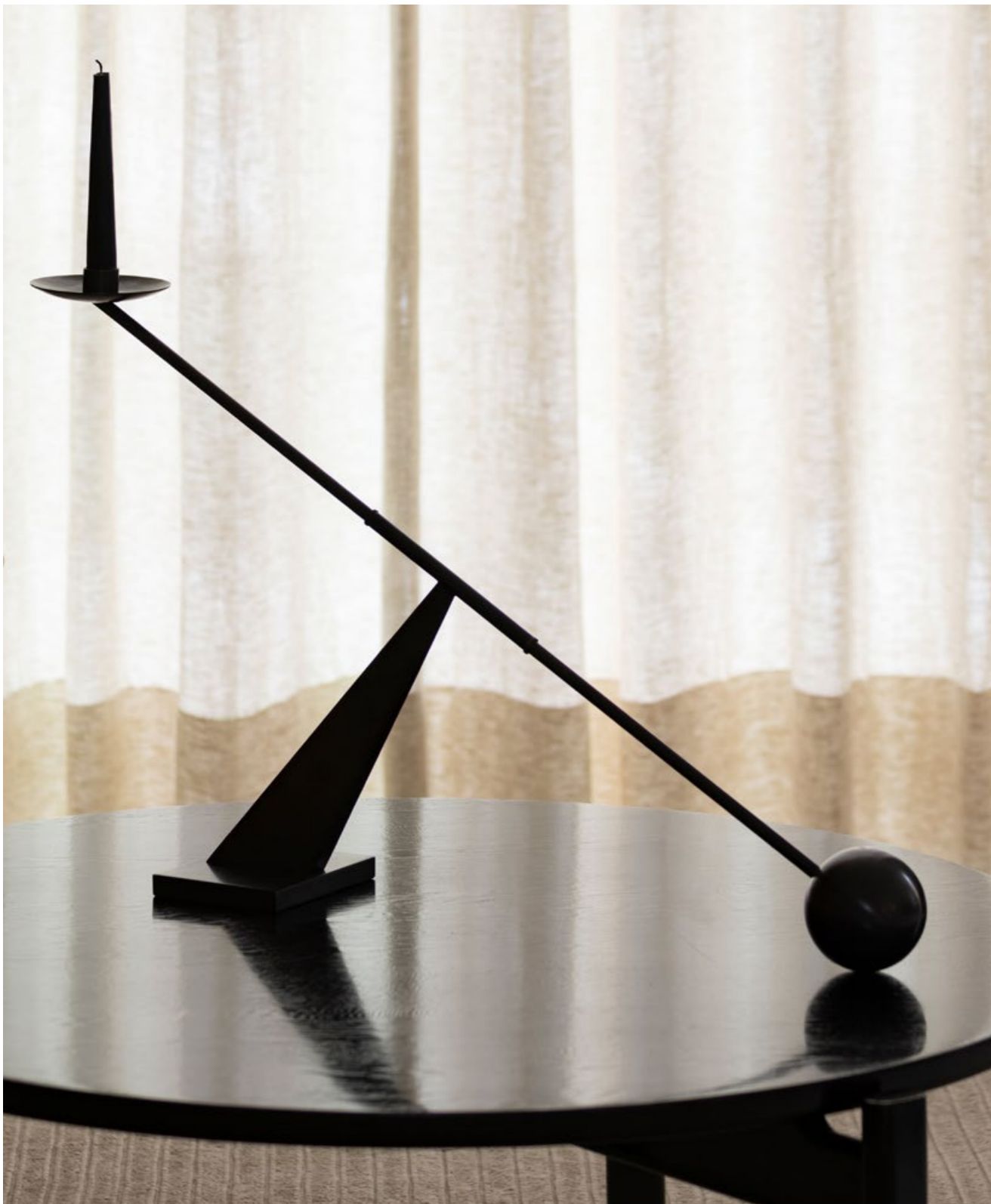
Interconnect Candle Holder, Black, by Colin King Studio Passage Lounge Table Ø90, Dark Lacquered Oak, by Krøyer-Sætter-Lassen