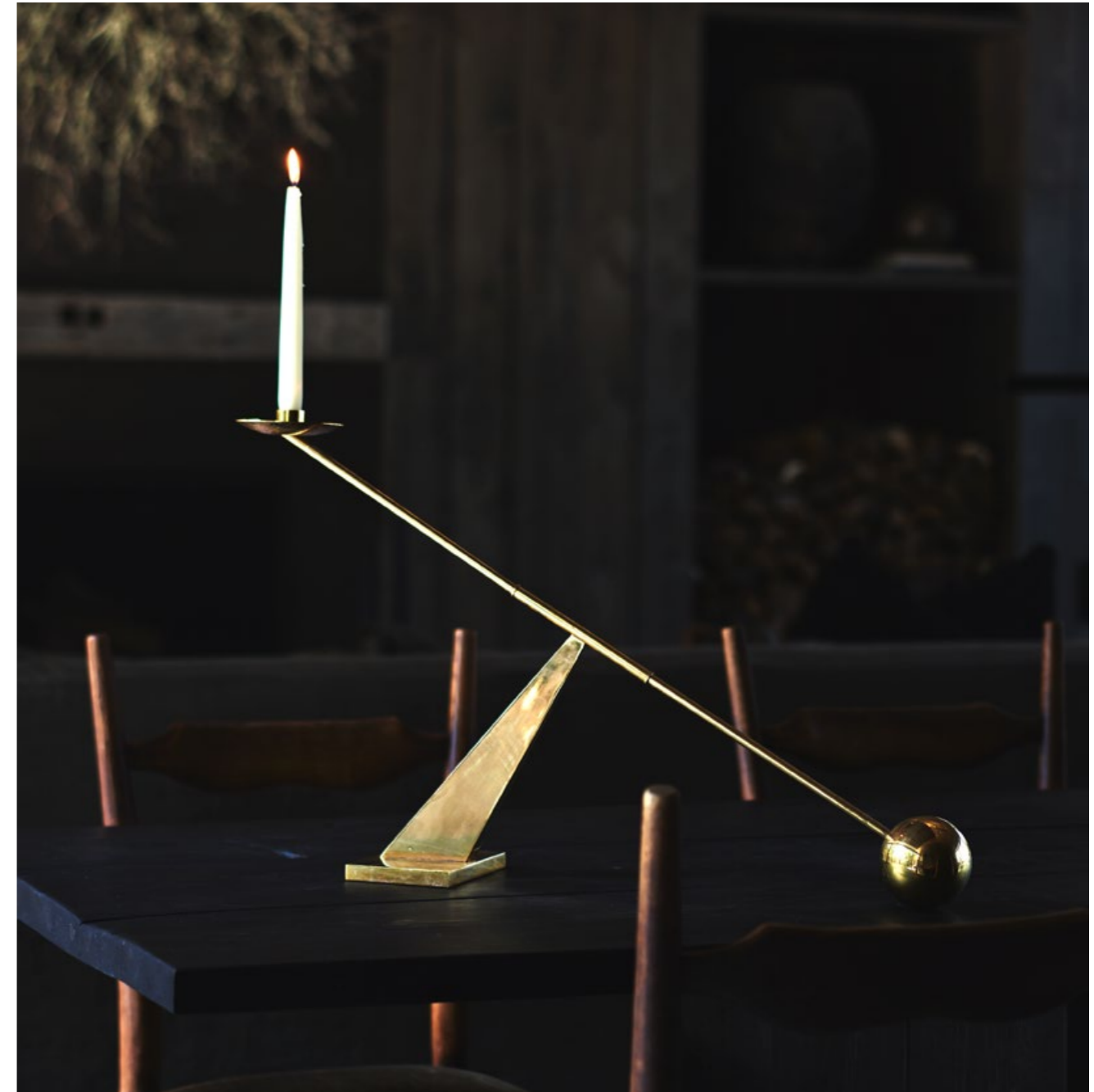
Interconnect Candle Holder, Polished Brass, by Colin King Studio

Nature humbles me and reminds me to abandon perfection. There's a lot of beauty to be found in unexpected places. Scale reminds me of this, too. If I can play with exaggerations without losing practicality, then I know I'm chasing a necessary balance. There's always a middle ground between control and letting go – and nothing should feel too modern or too classic.