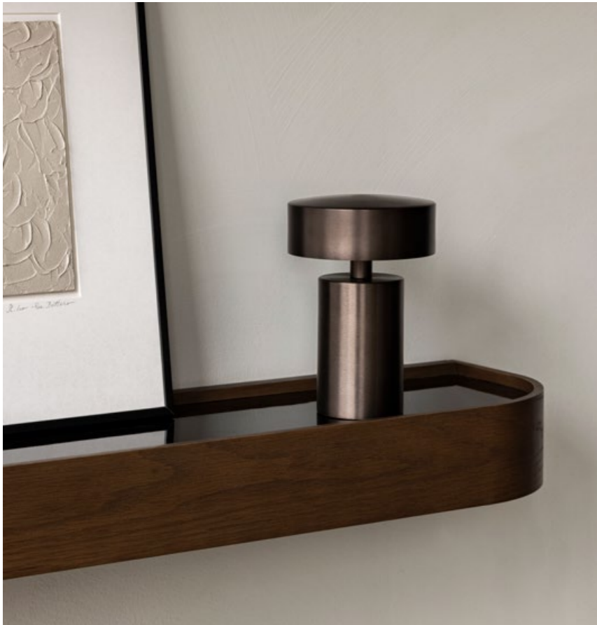
Epoch Shelf, 79, Dark Stained Oak / Black, by Nina Bruun Column Table Lamp, by Norm Architects