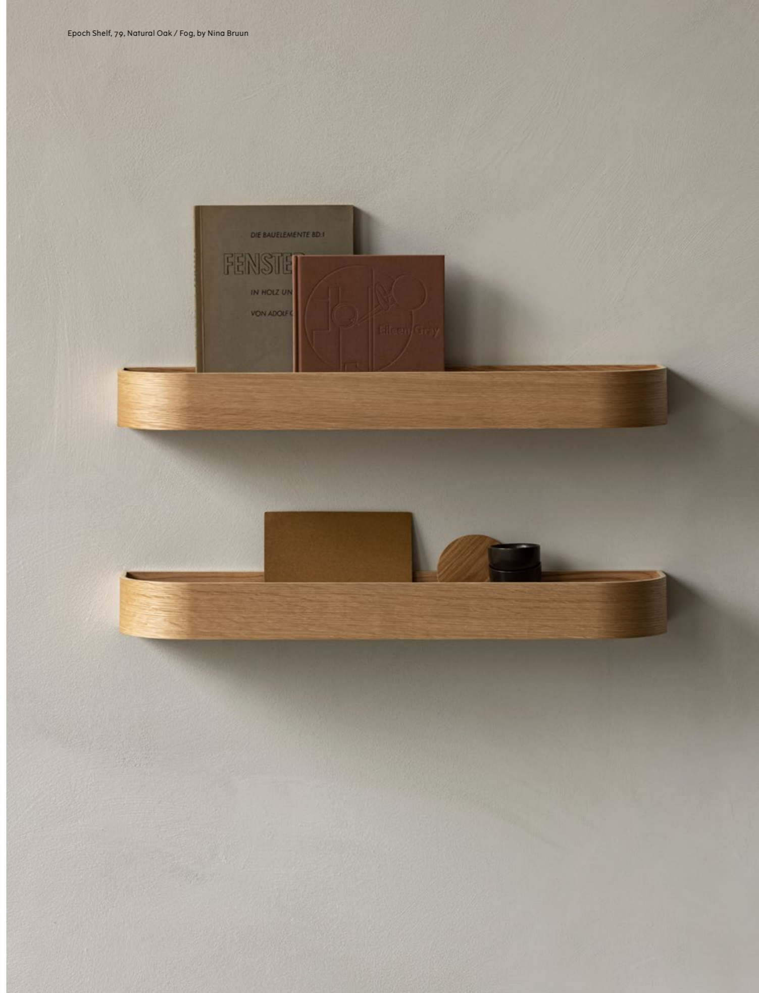
Epoch Shelf, 79, Natural Oak / Fog, by Nina Bruun