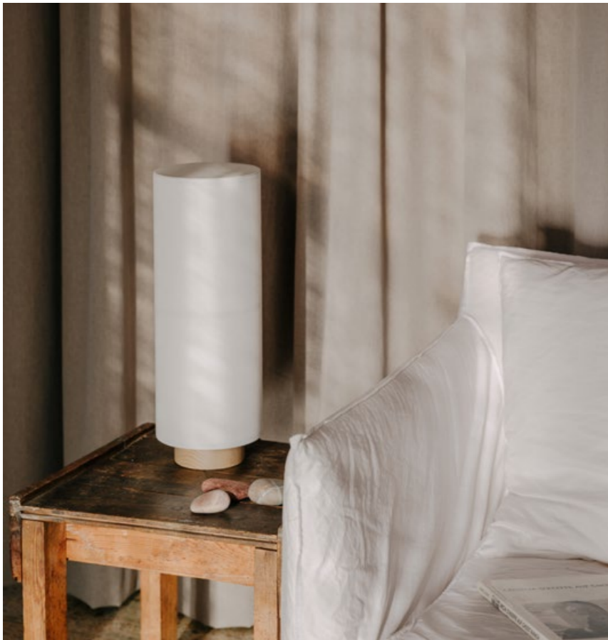
Hashira Table Lamp by Norm Architects