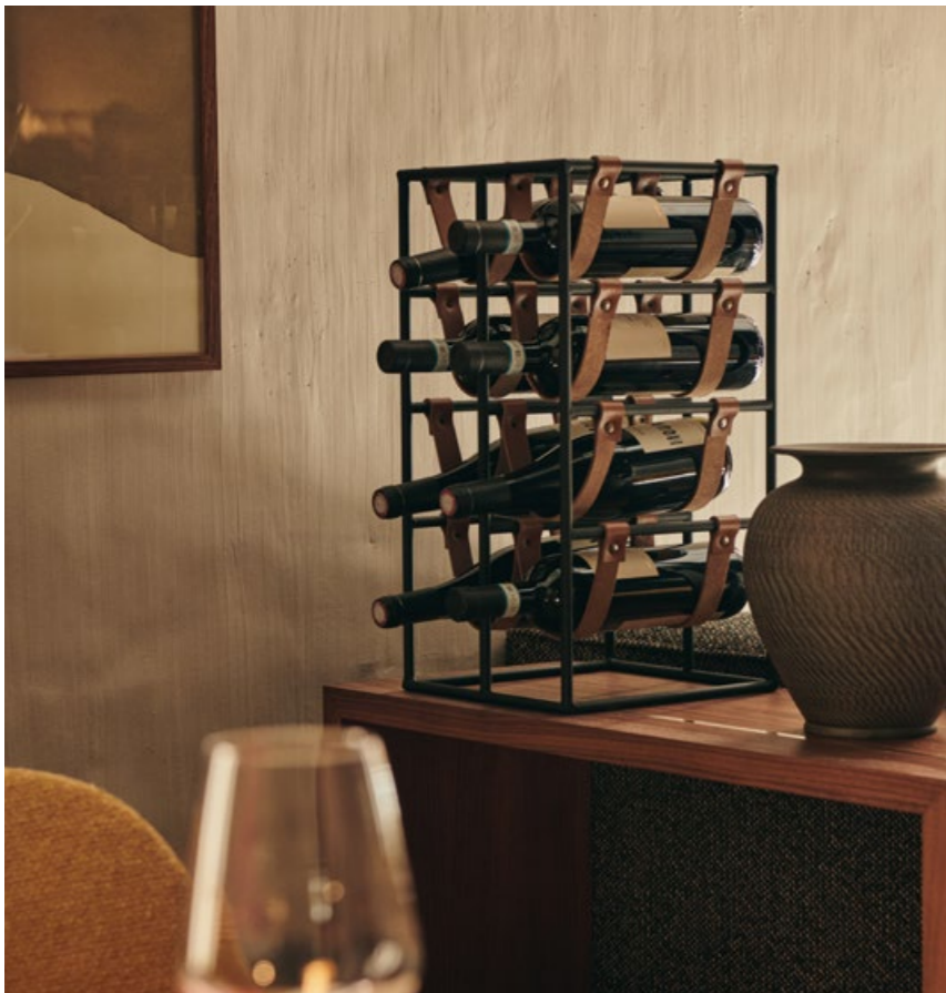
Umanoff Wine Rack, Black / Cognac, by Arthur Umanoff