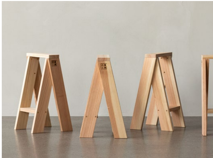
Ishinomaki AA Stool, H72, by TORAFU ARCHITECTS

With a common mission to connect over good design and honest materials, MENU and Ishinomaki Laboratory present the AA Stool, designed by TORAFU ARCHITECTS and the first in a series of DIY products. Produced in Denmark from local wood, the exposed screws, dimensional lumber and handcrafted look highlight just how innovative simplicity can be. Crafted from Danish Douglas fir and named after the shape of its profile, the flat pack stool has an untreated finish, customisable to the desired expression and which will patinate beautifully over time. Each pack of two stools is offered in two sizes – medium or tall – which can be used individually or in combination to create a wider seat.