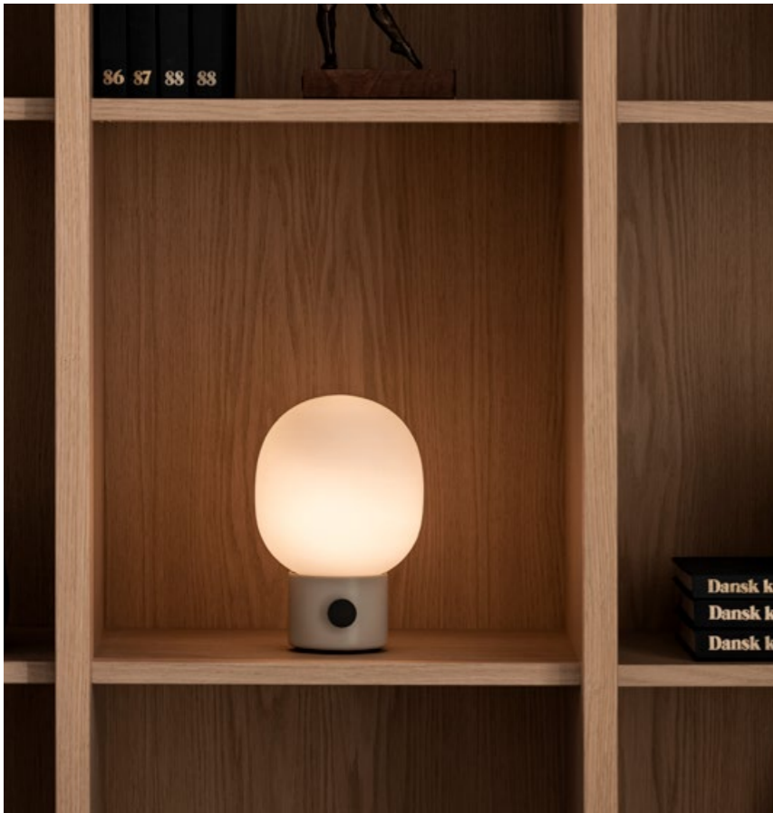
JWDA Table Lamp, Portable, Steel, Alabaster White, by Jonas Wagell