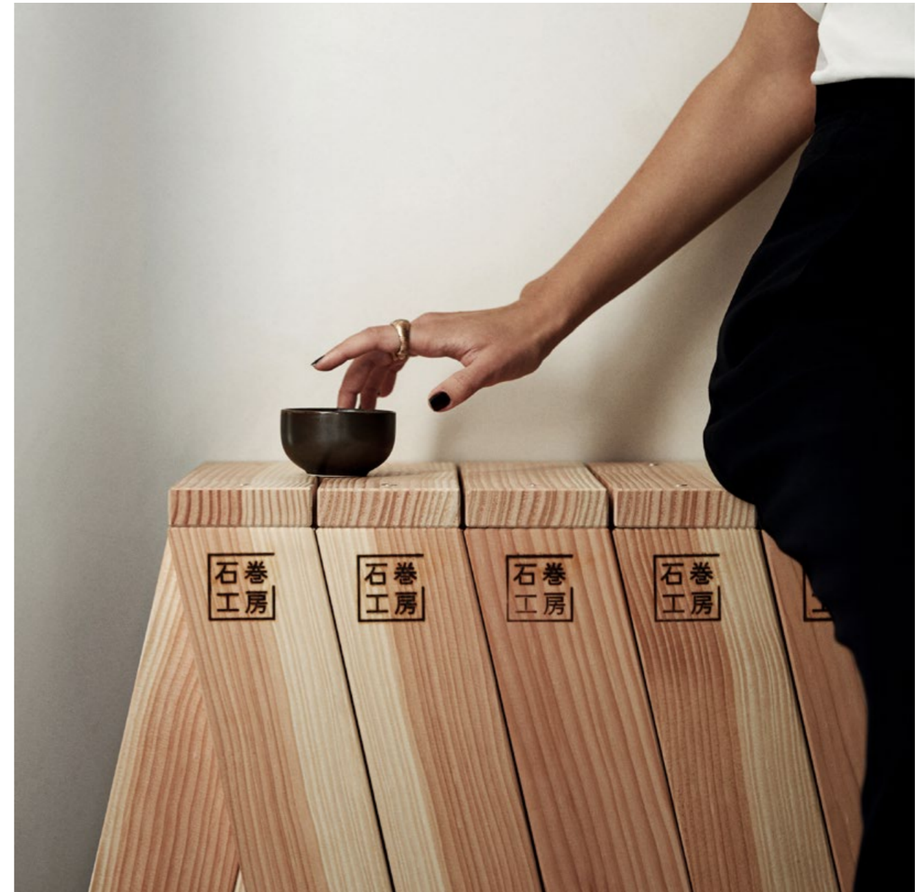
Ishinomaki AA Stool, H56, by TORAFU ARCHITECTS

I believe that Ishinomaki Laboratory is now more than just a brand which originated in a disaster-stricken area: it has become a model for small, local brands and ventures contributing to regional revitalisation.