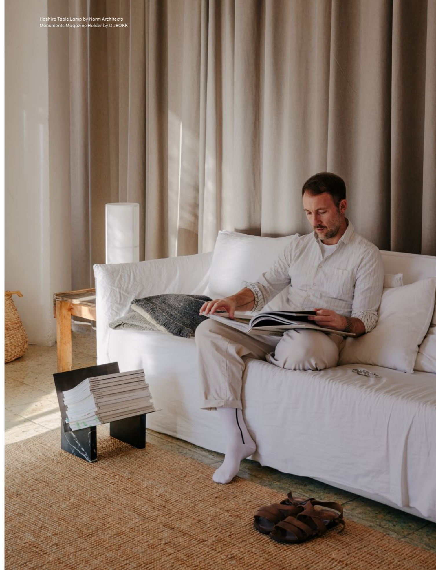
Hashira Table Lamp by Norm Architects Monuments Magazine Holder by DUBOKK