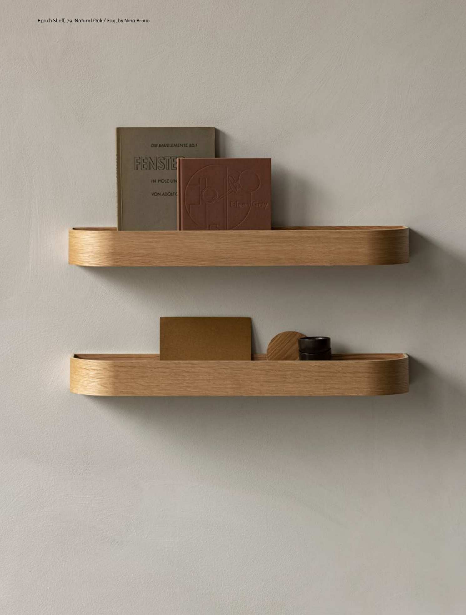
Epoch Shelf, 79, Natural Oak / Fog, by Nina Bruun