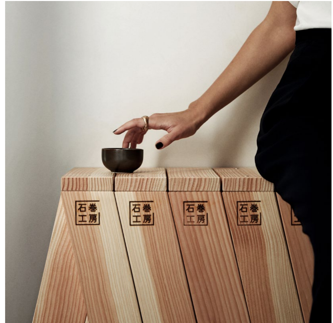
Ishinomaki AA Stool, H56, by TORAFU ARCHITECTS

I believe that Ishinomaki Laboratory is now more than just a brand which originated in a disaster-stricken area: it has become a model for small, local brands and ventures contributing to regional revitalisation.