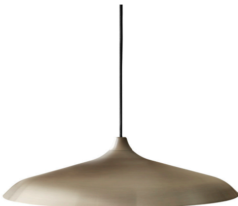
Bronzed Brass 1680869