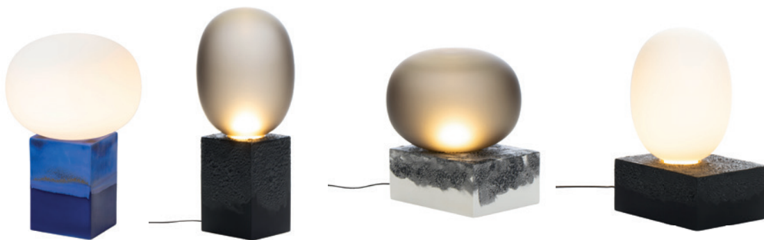
magma one low