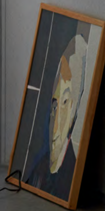
BUDDY Floor lamp