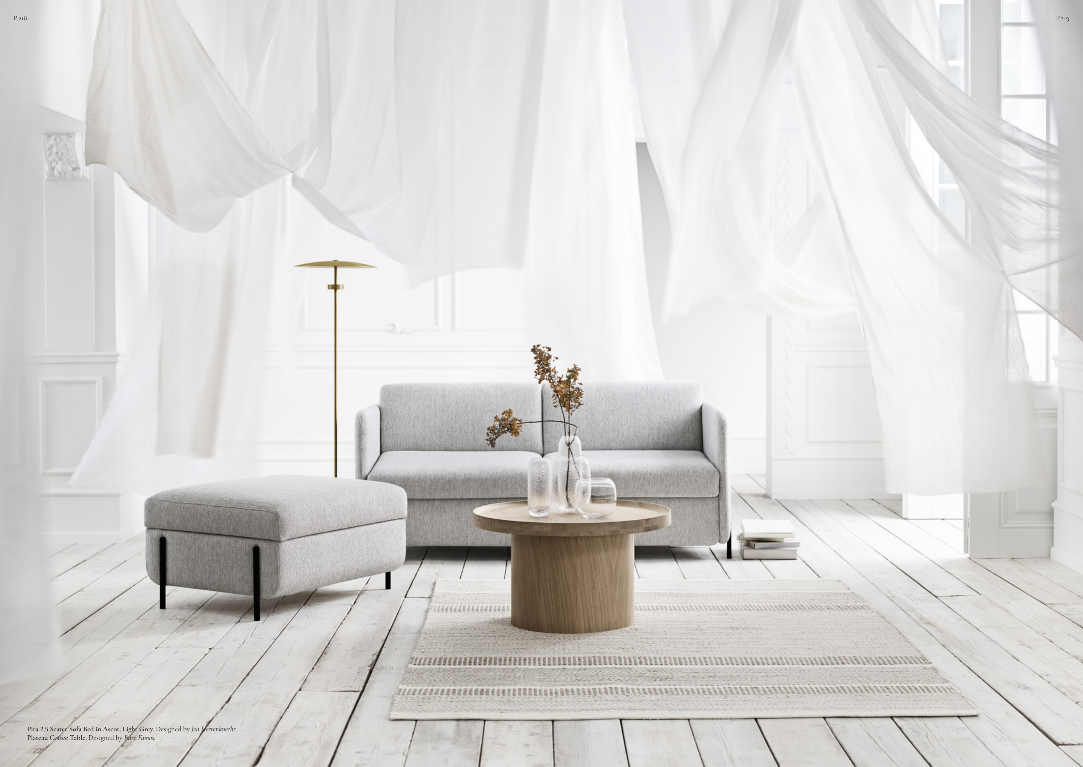
Pira 2.5 Seater Sofa Bed in Ascot, Light Grey. Designed by Joa Herrenknecht. Plateau Coffee Table. Designed by Büro Famos.