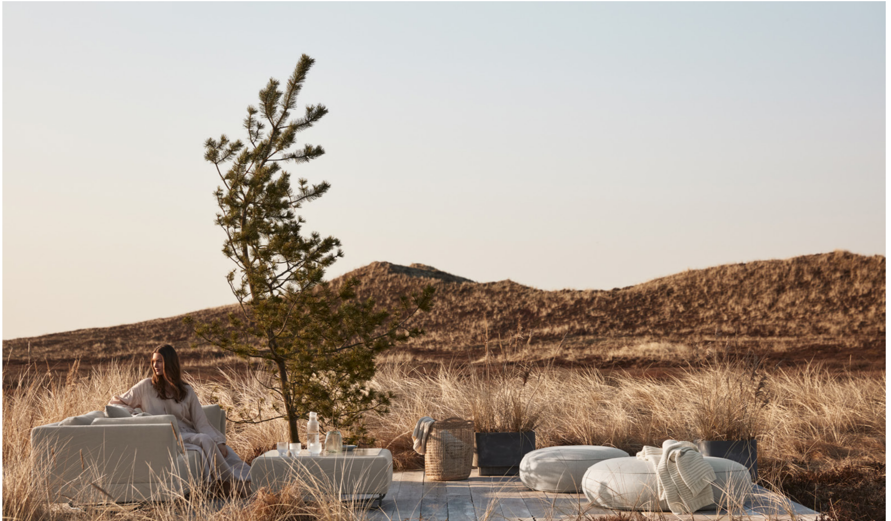
Orlando Outdoor O2 Modular Sofa. Designed by Glismand & Rüdiger . Calm Poufs in Ocean, Light Grey. Designed by Ferriani Sbolgi .