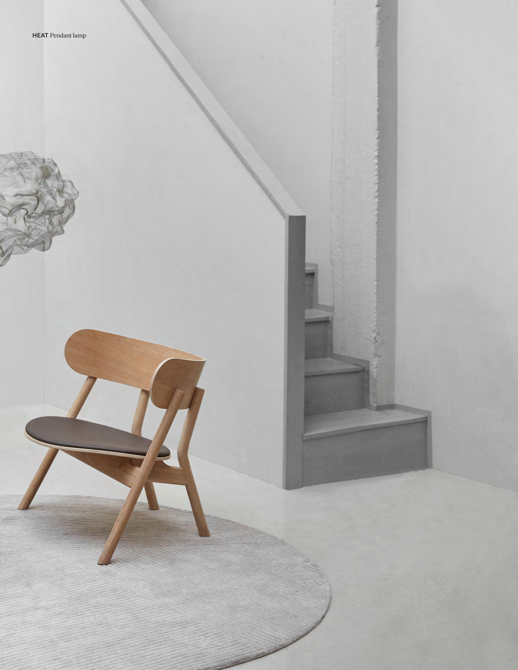
HEAT Pendant lamp