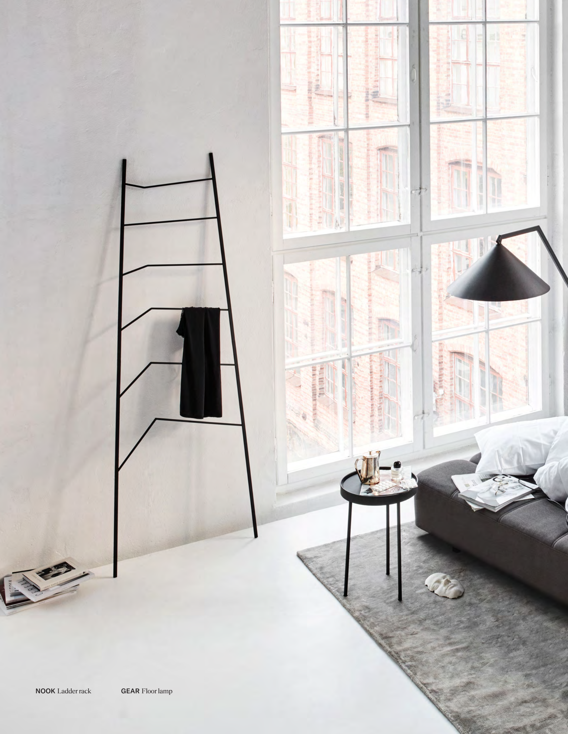
NOOK Ladder rack