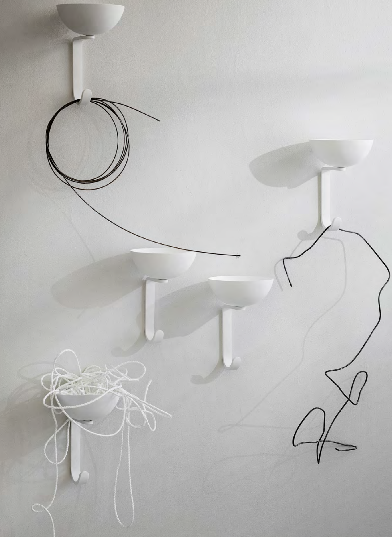
NEST Wall hook / storage