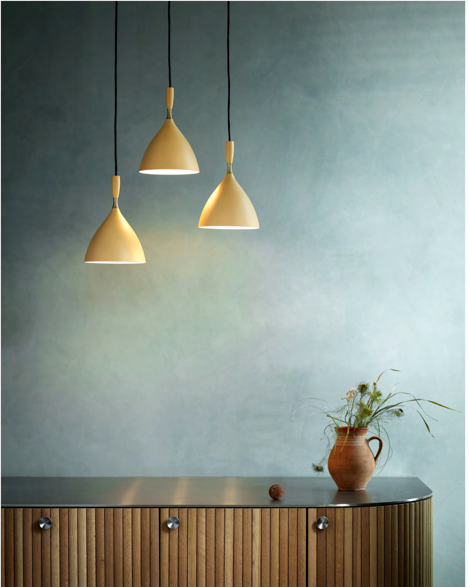
DOKKA Pendant lamp