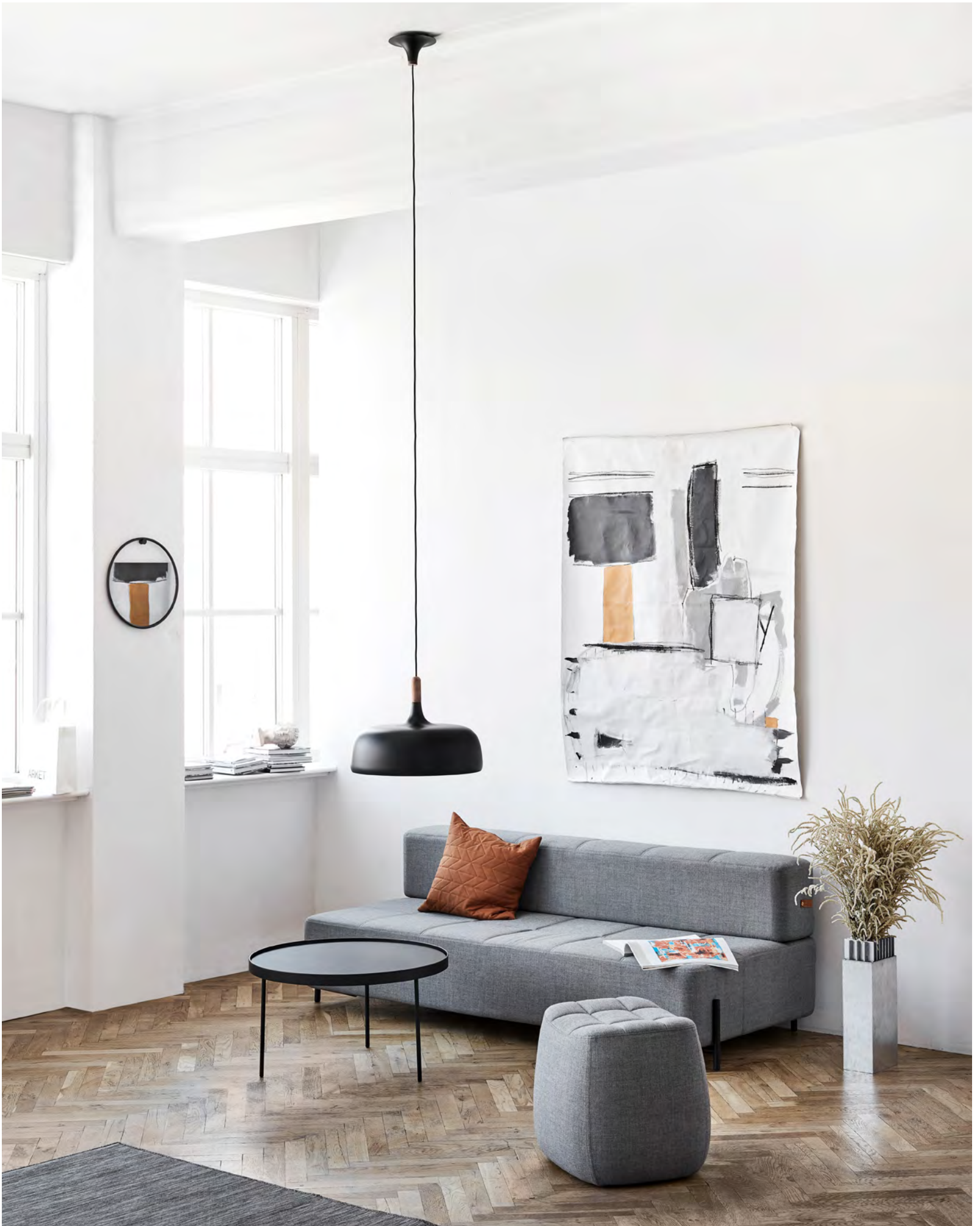
ACORN Pendant lamp