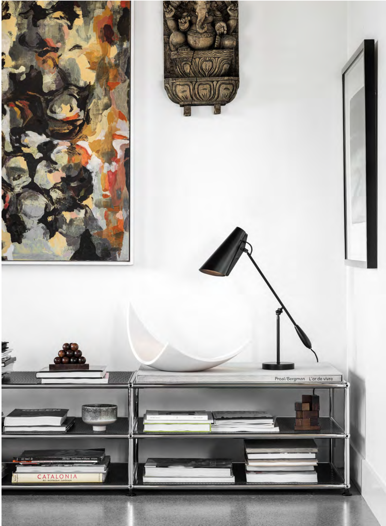
BIRDY Table lamp