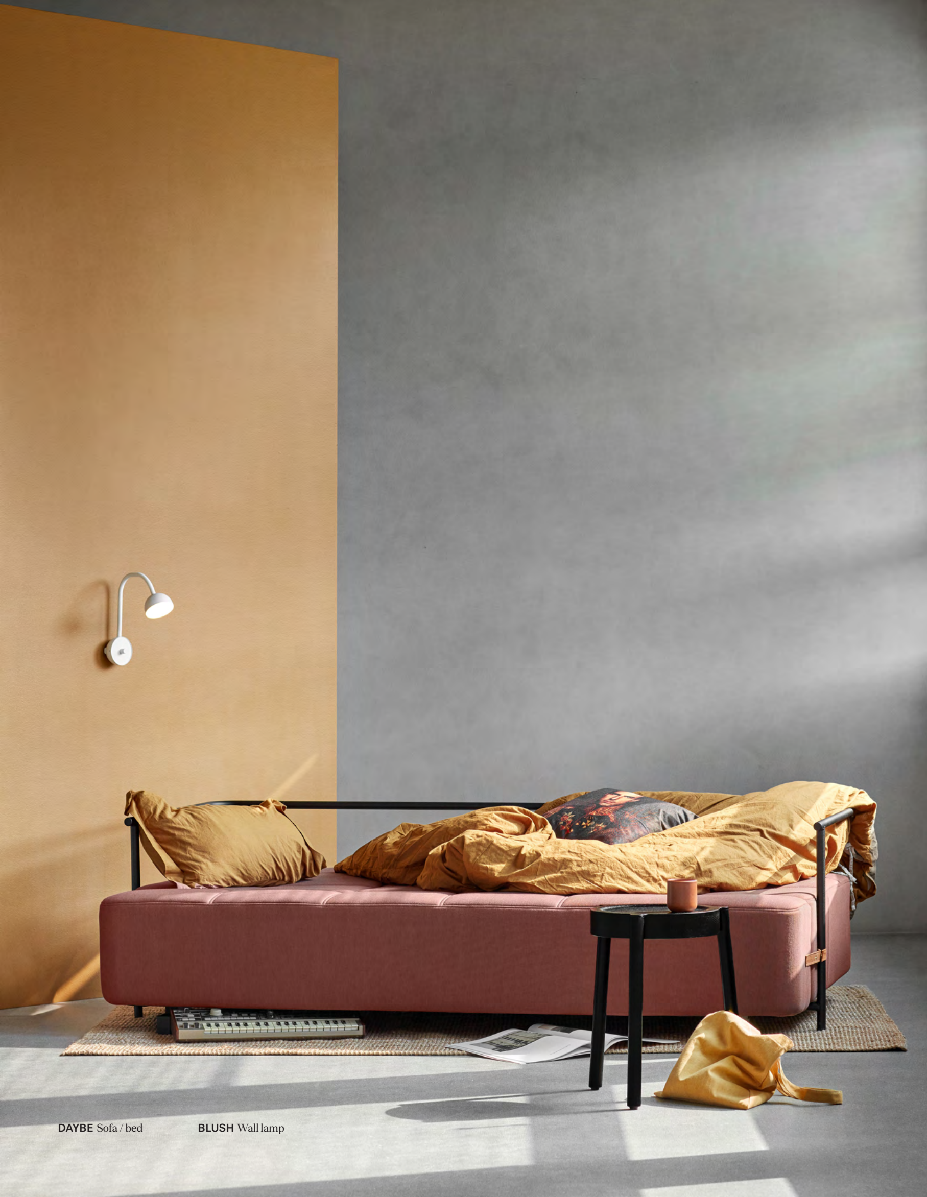
DAYBE Sofa / bed