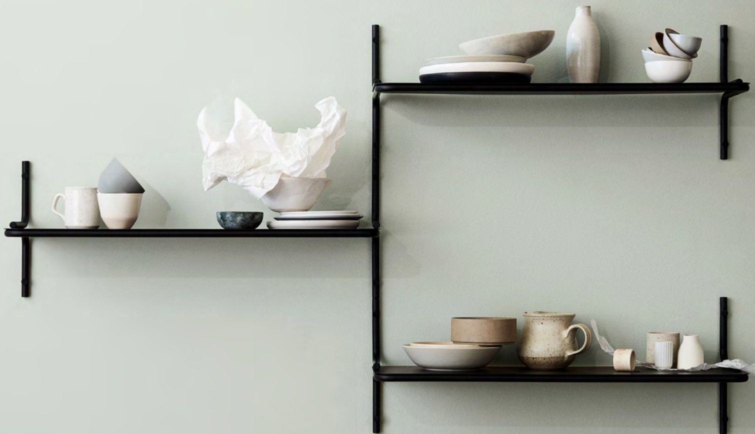
WIRED Wall shelf system