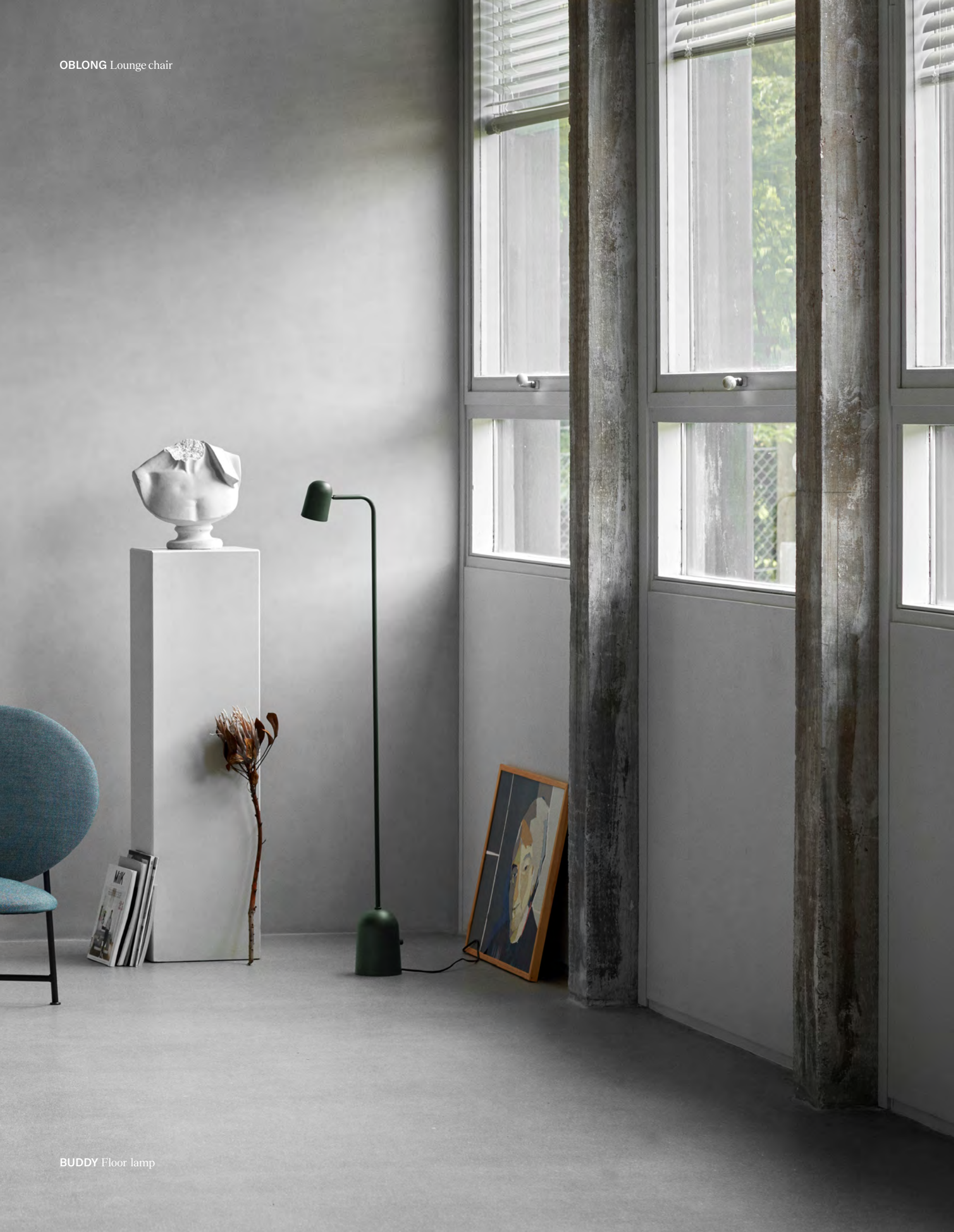
BUDDY Floor lamp