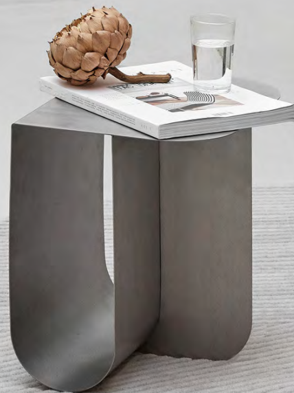
MASS Side table