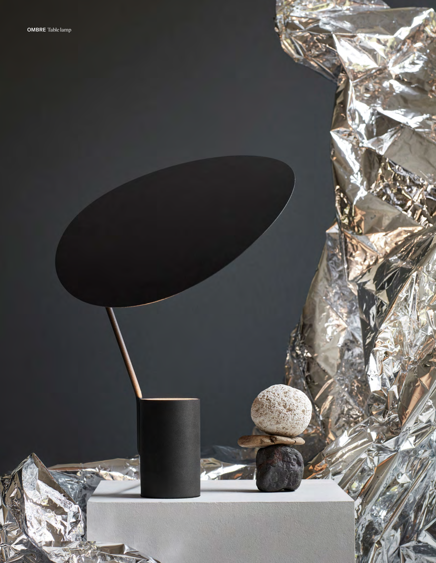
OMBRE Table lamp