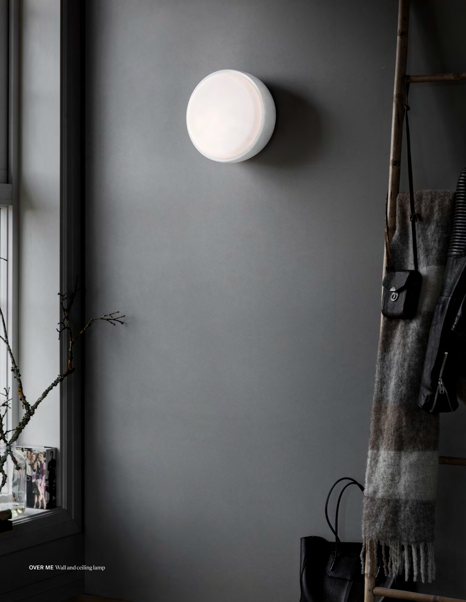
OVER ME Wall and ceiling lamp