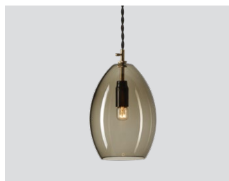
Unika large grey – Item no. 536