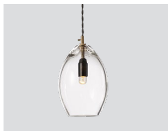
Unika large transparent – Item no. 531