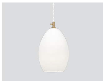
Unika large white – Item no. 533