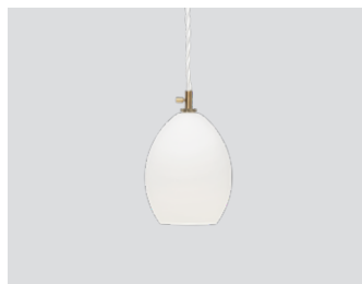
Unika small white – Item no. 532