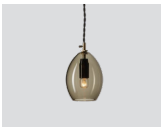
Unika small grey – Item no. 535