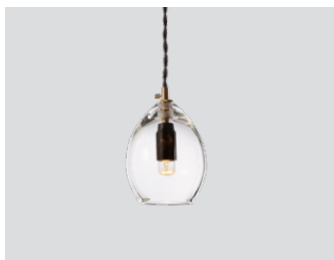
Unika small transparent – Item no. 530