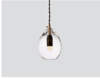
Unika small transparent – Item no. 530