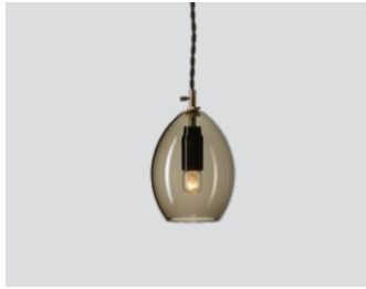
Unika small grey – Item no. 535