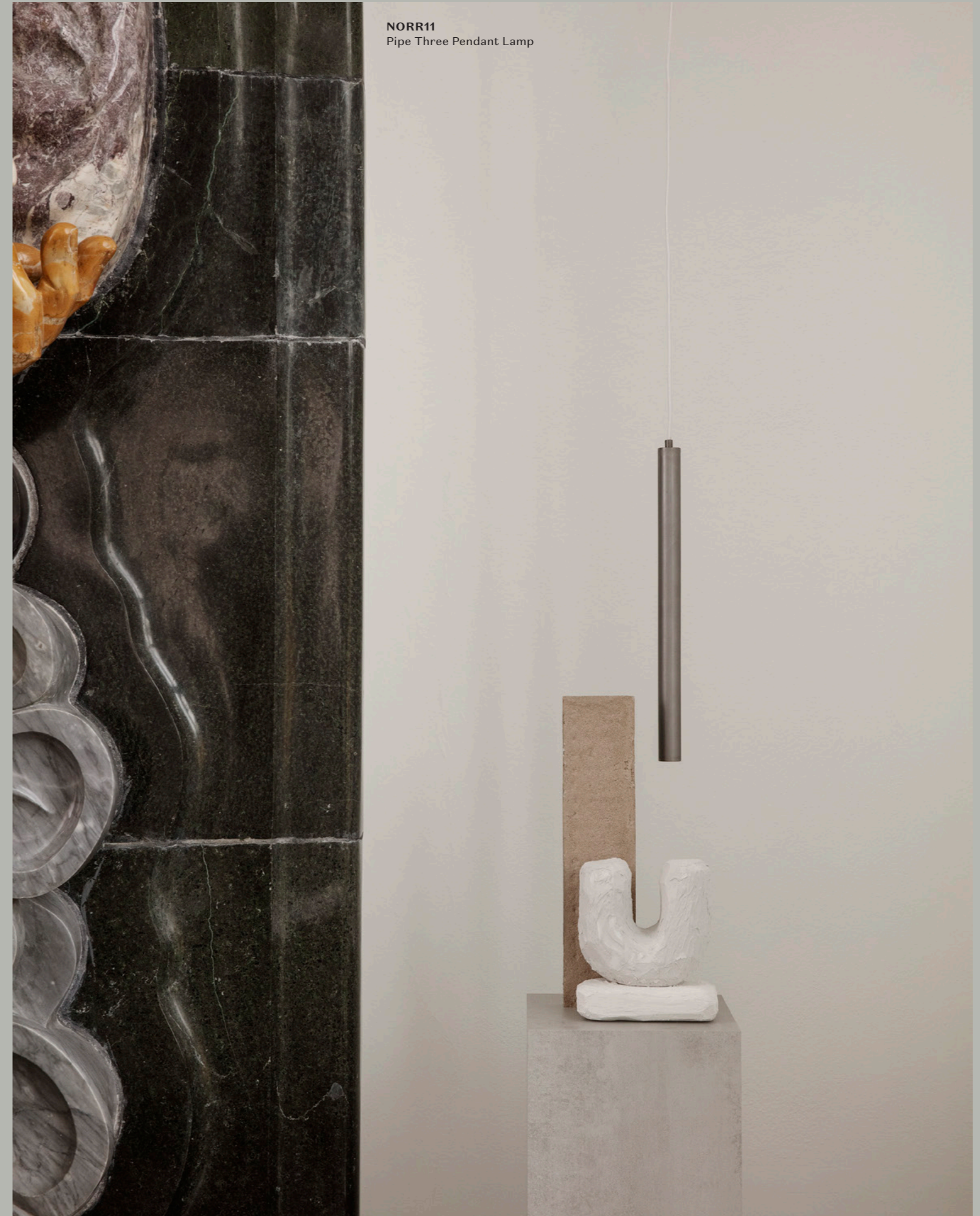
NORR11 Pipe Three Pendant Lamp