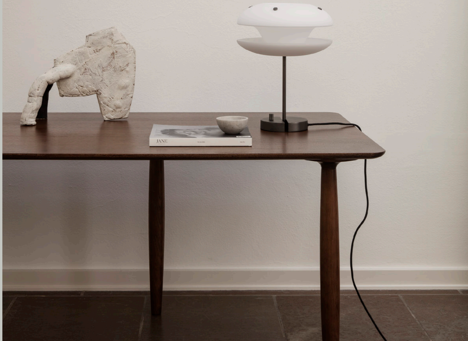
NORR11 Yo-Yo Table Lamp — Oku Dining Table