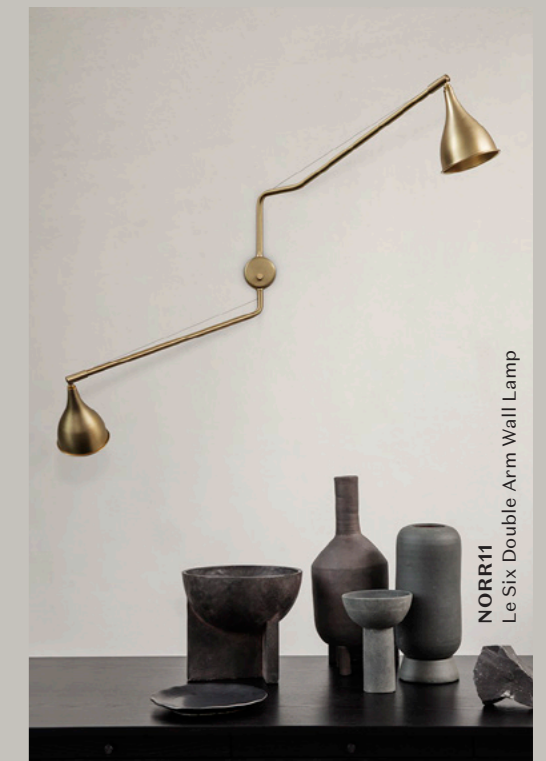
NORR11 Le Six Double Arm Wall Lamp