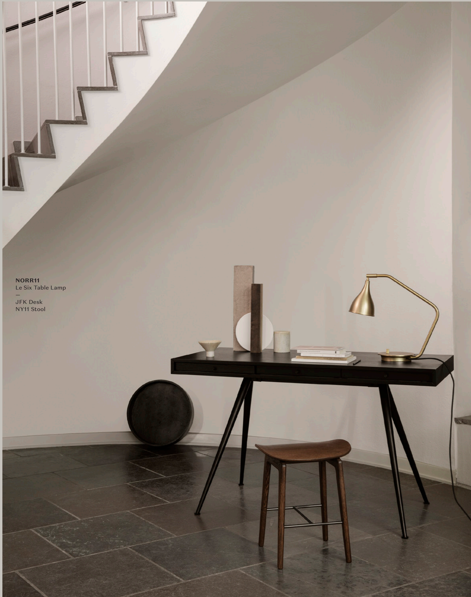
NORR11 Le Six Table Lamp — JFK Desk NY11 Stool