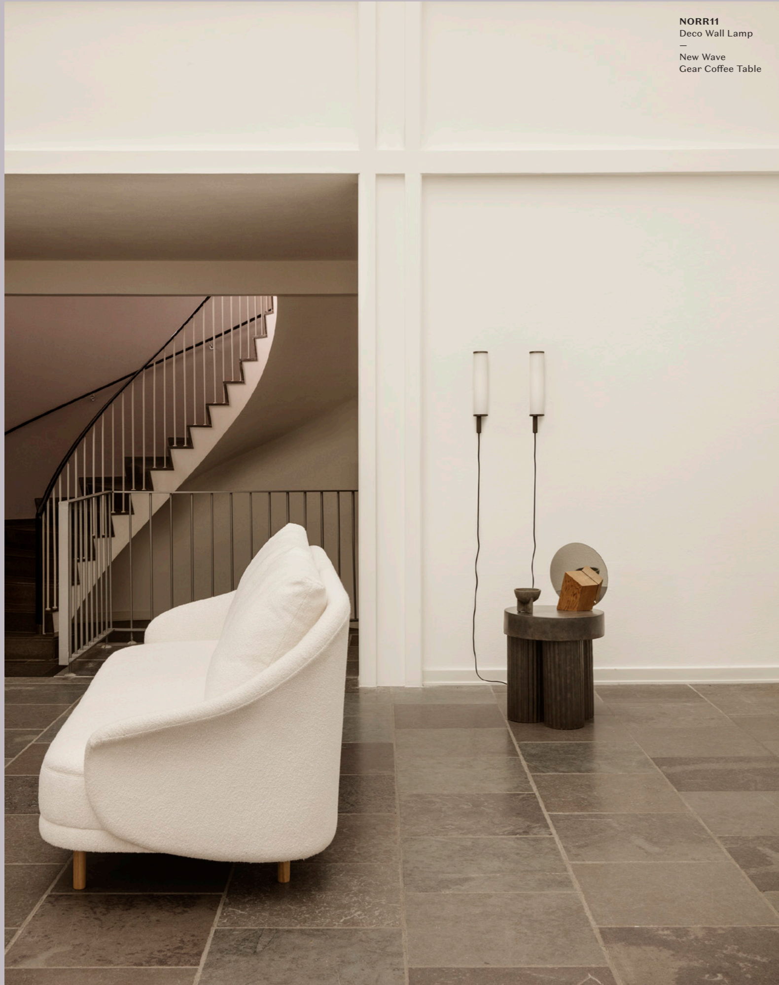
NORR11 Deco Wall Lamp — New Wave Gear Coffee Table