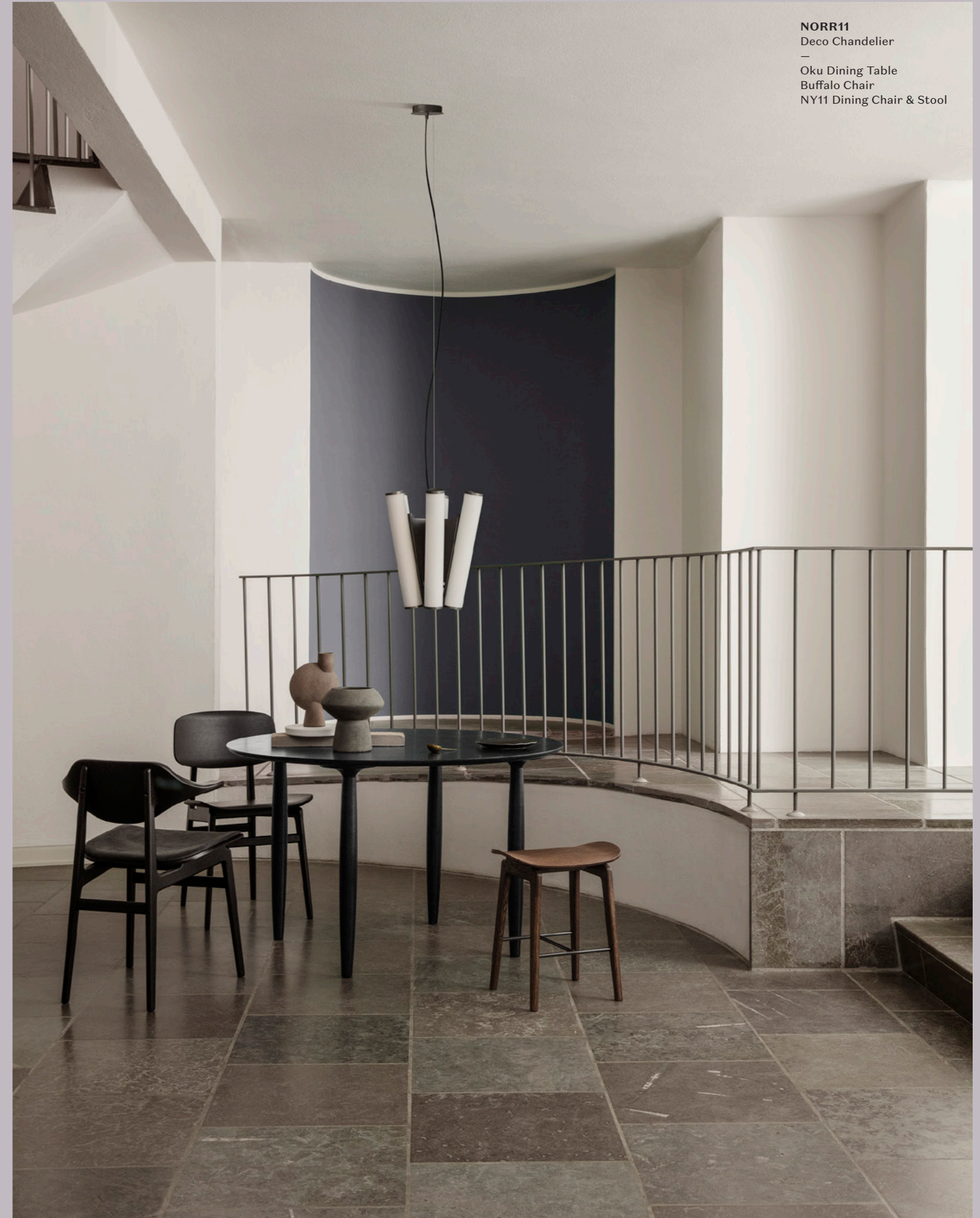
NORR11 Deco Chandelier — Oku Dining Table Buffalo Chair NY11 Dining Chair & Stool