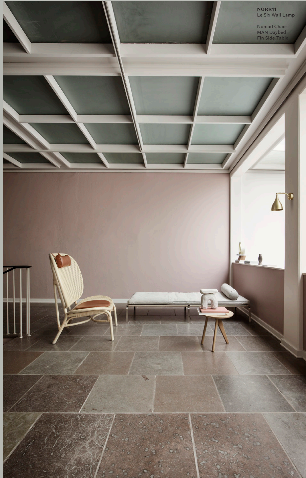
NORR11 Le Six Wall Lamp — Nomad Chair MAN Daybed Fin Side Table