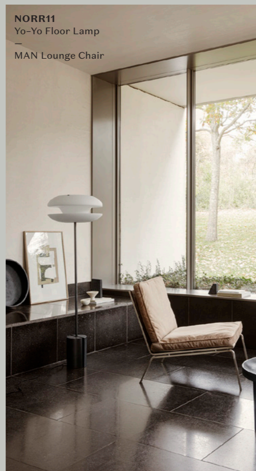
NORR11 Yo-Yo Floor Lamp — MAN Lounge Chair