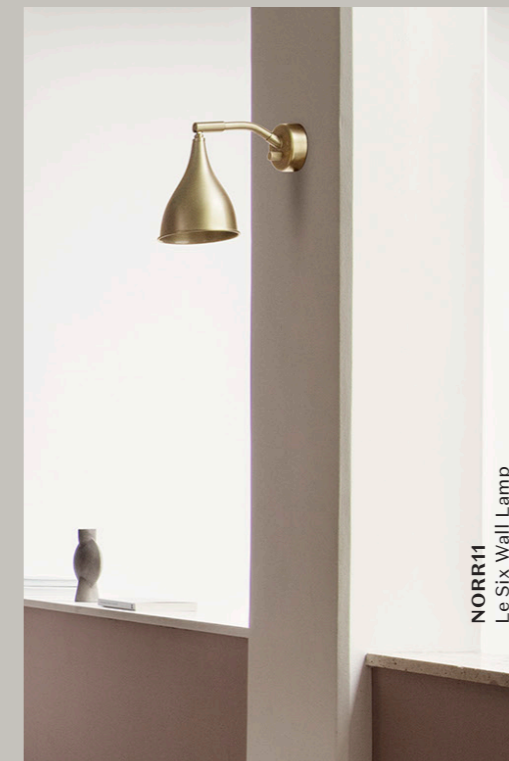
NORR11 Le Six Wall Lamp