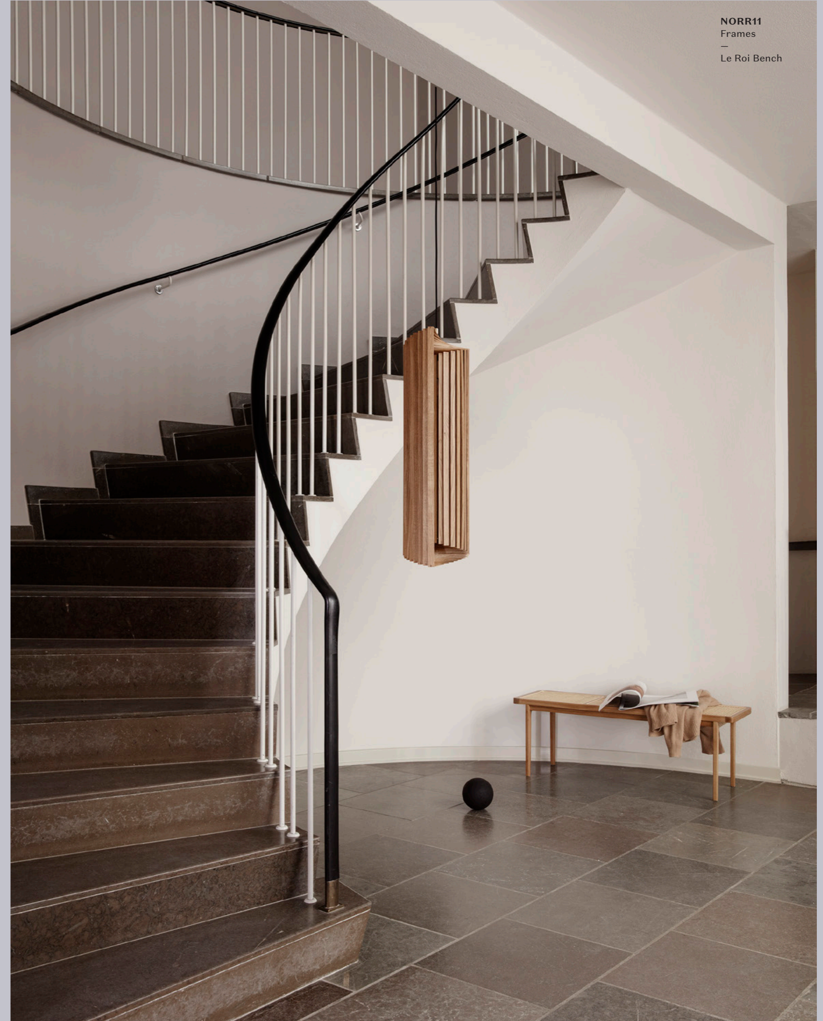
NORR11 Frames — Le Roi Bench

The design consists of 72 joints. Every single frame is handmade and quality checked before it's connected with carefully selected parts in brass. Frames is available in 4 different wood finishes; natural, smoked, dark stained and black.