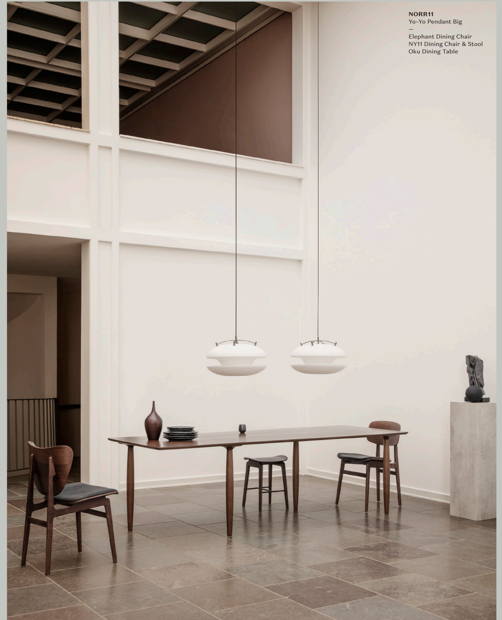
NORR11 Yo-Yo Pendant Big — Elephant Dining Chair NY11 Dining Chair & Stool Oku Dining Table

The Yo-Yo collection features two pendant lamps, as well as a table and floor lamp.