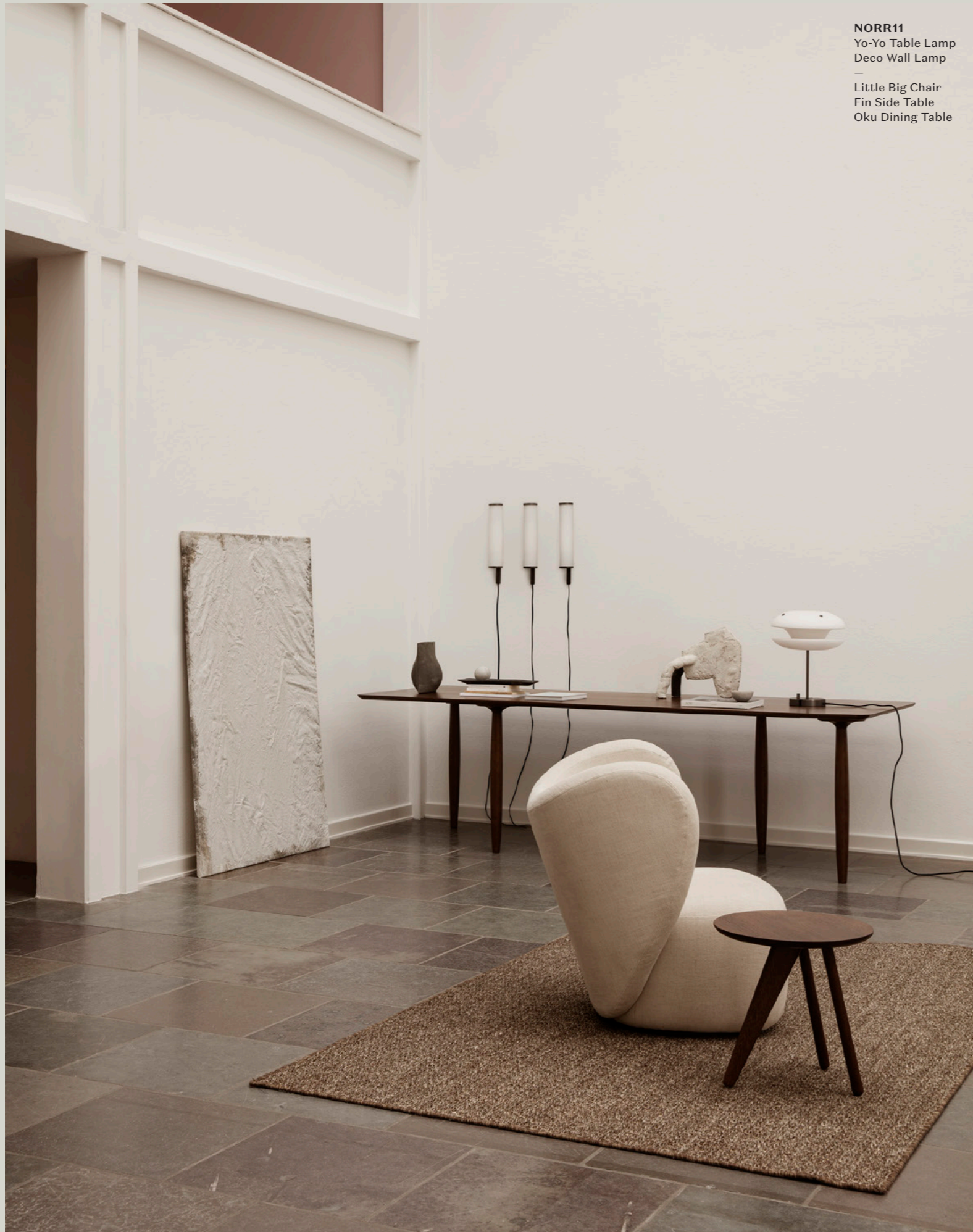
NORR11 Yo-Yo Table Lamp Deco Wall Lamp — Little Big Chair Fin Side Table Oku Dining Table