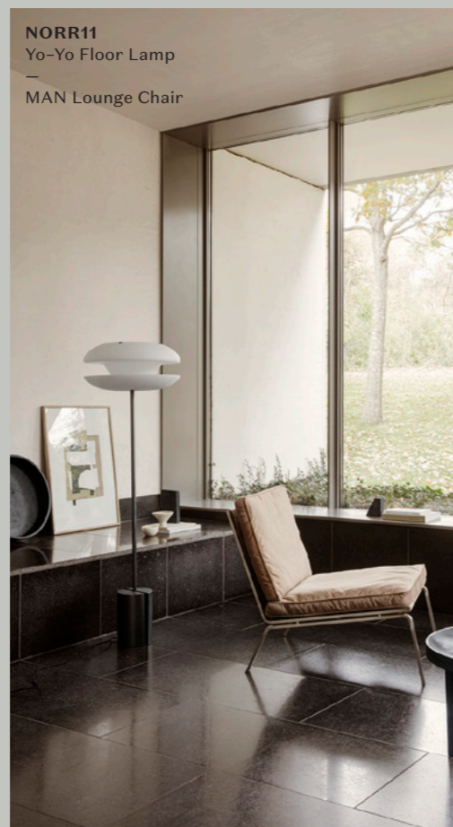
NORR11 Yo-Yo Floor Lamp — MAN Lounge Chair