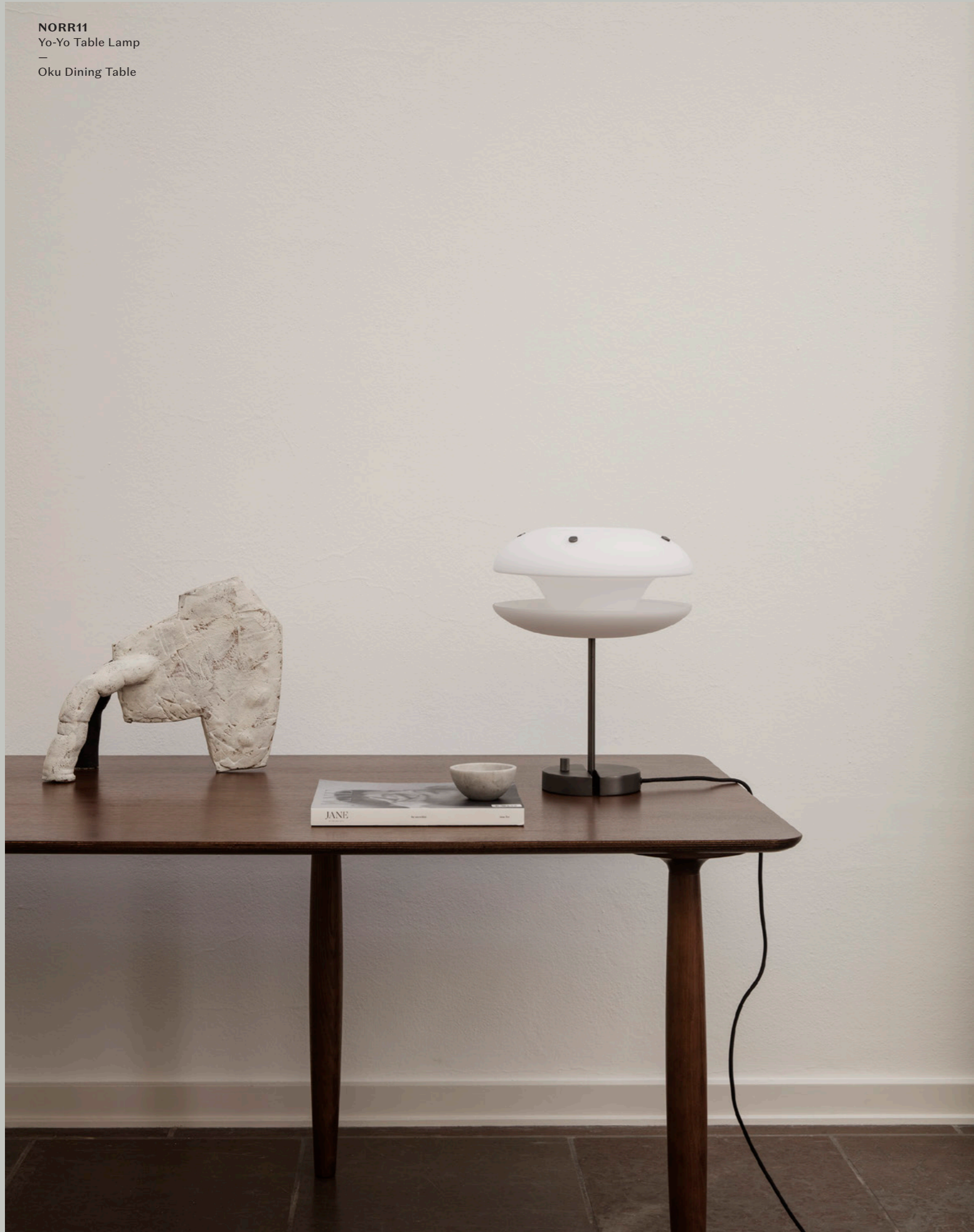
NORR11 Yo-Yo Table Lamp — Oku Dining Table