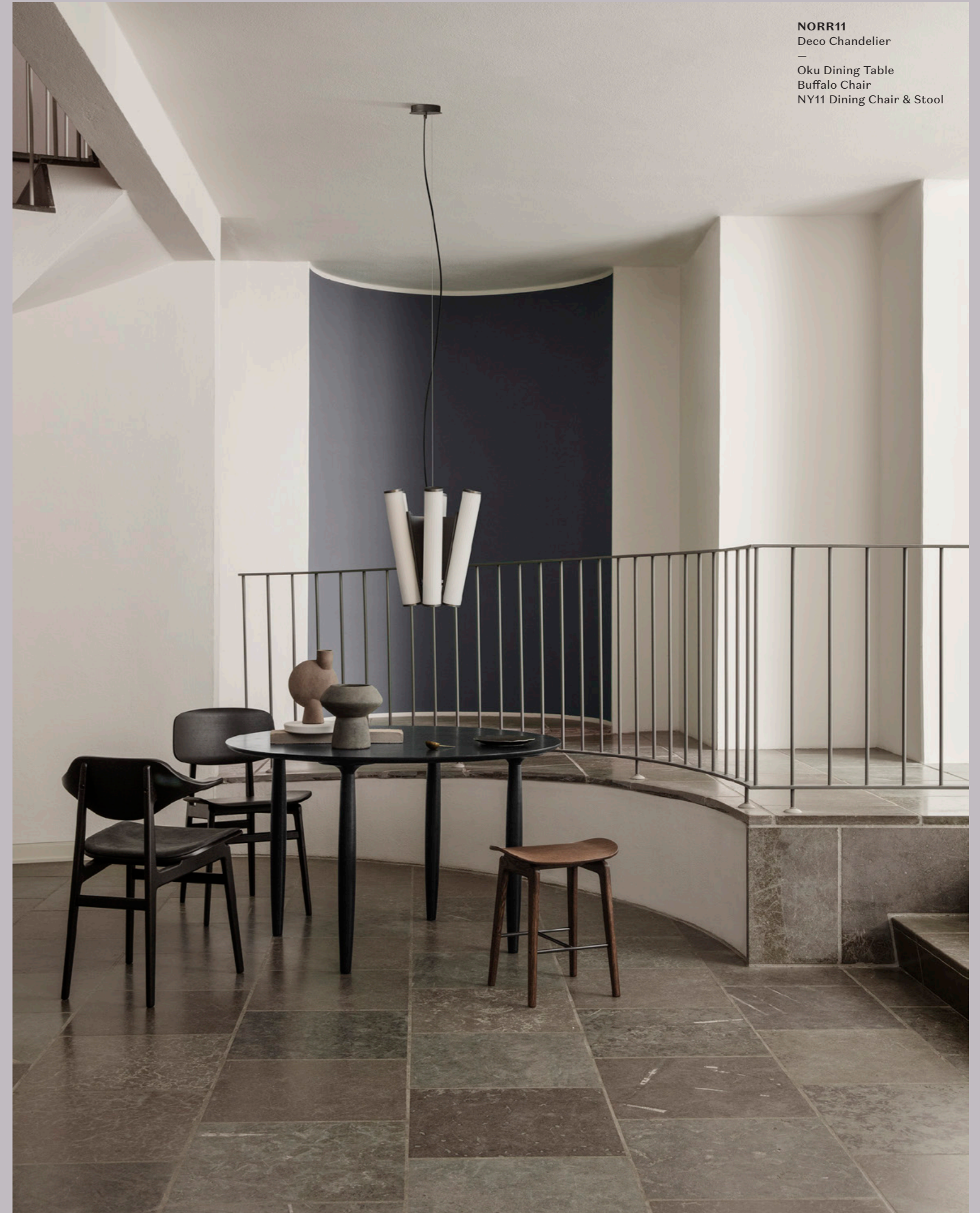
NORR11 Deco Chandelier — Oku Dining Table Buffalo Chair NY11 Dining Chair & Stool