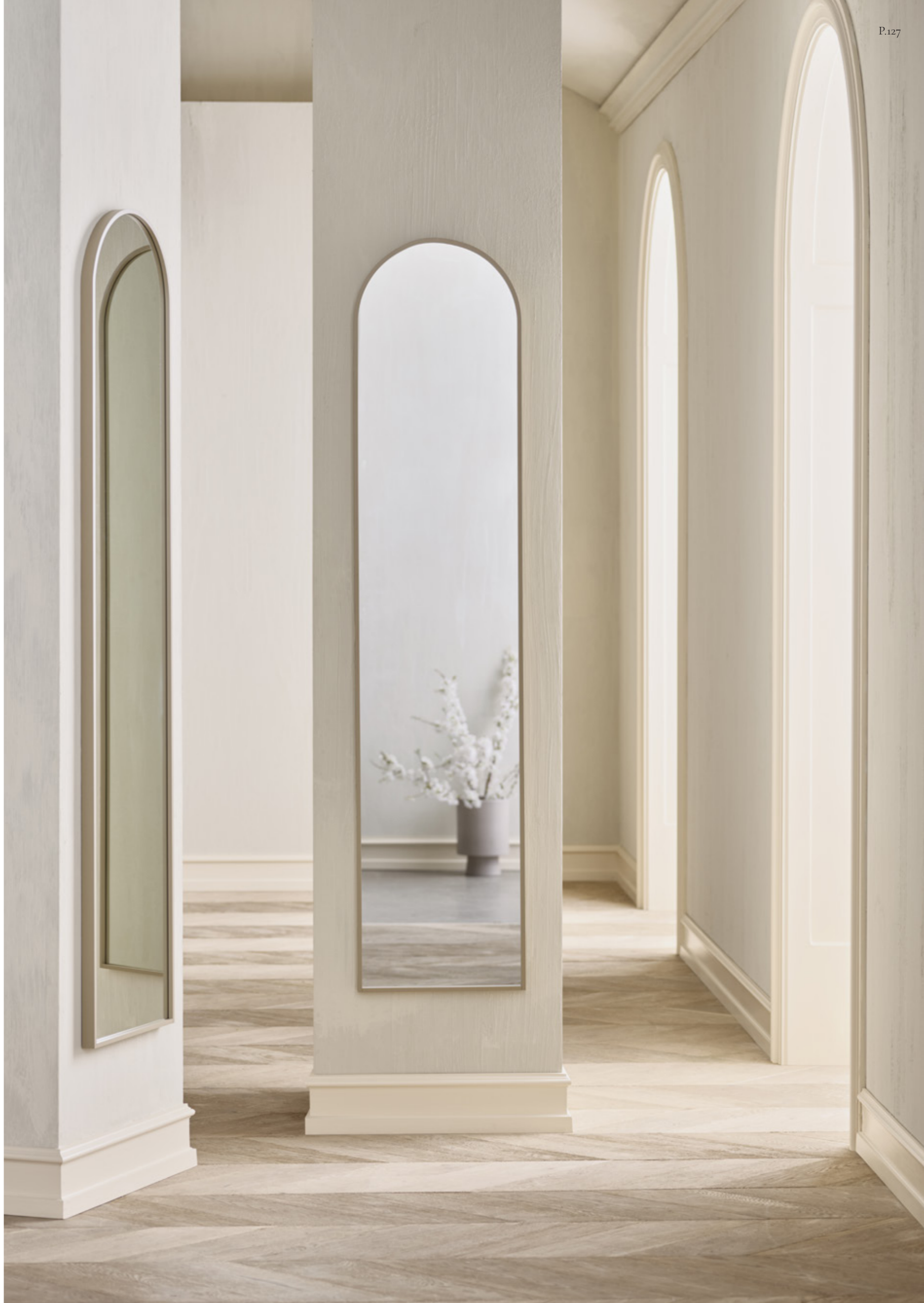
Ripple Mirror. Designed by Büro Famos.