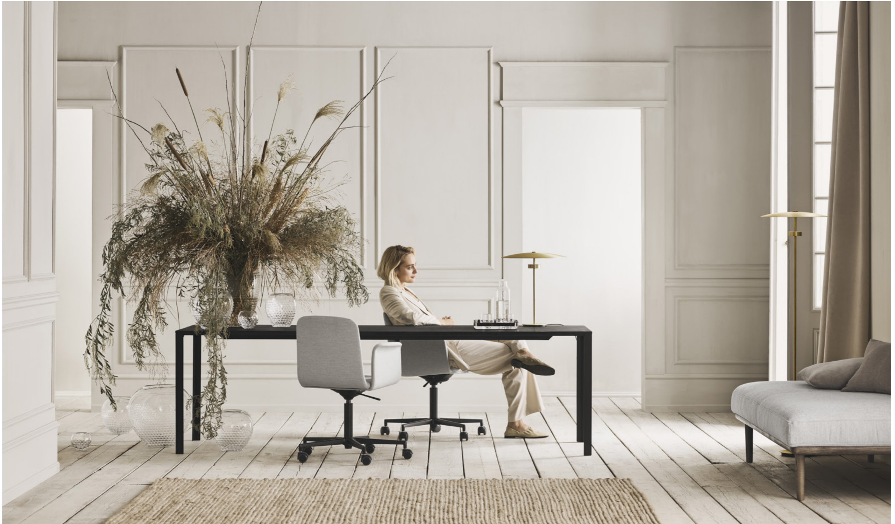
Link Table. Designed by Glismand & Rüdiger . Palm Chair with wheels in Baize, Grey. Designed by Says Who . Madison Daybed in Memory, Grey-White. Designed by Glismand & Rüdiger .