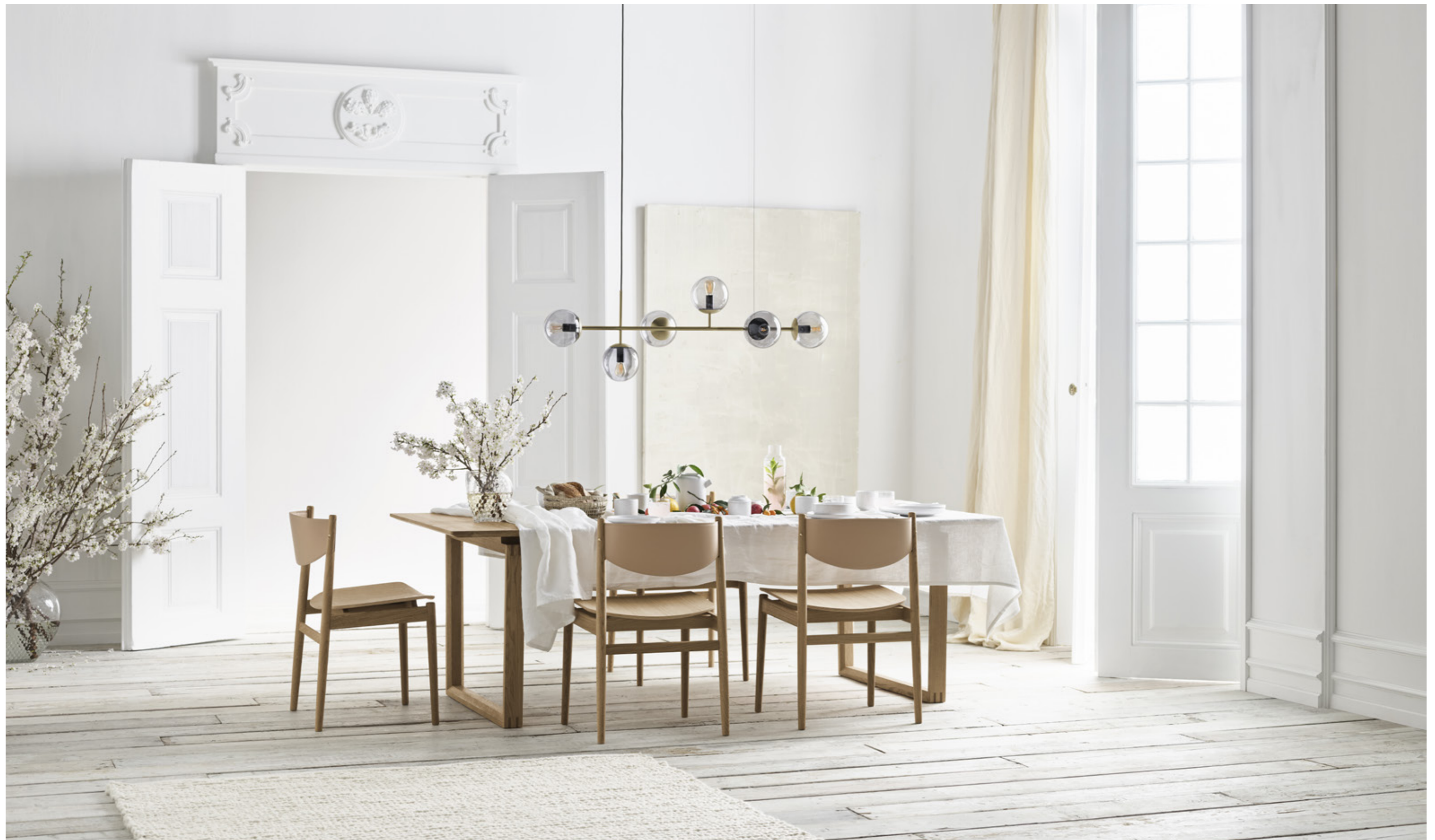
Nord Table. Designed by Glismand & Rüdiger . Apelle Chair. Designed by Busetti Garuti Redaelli . Orb Pendant. Designed by 365° North . Scandinavia Rug. Designed by Bolia Design Team .