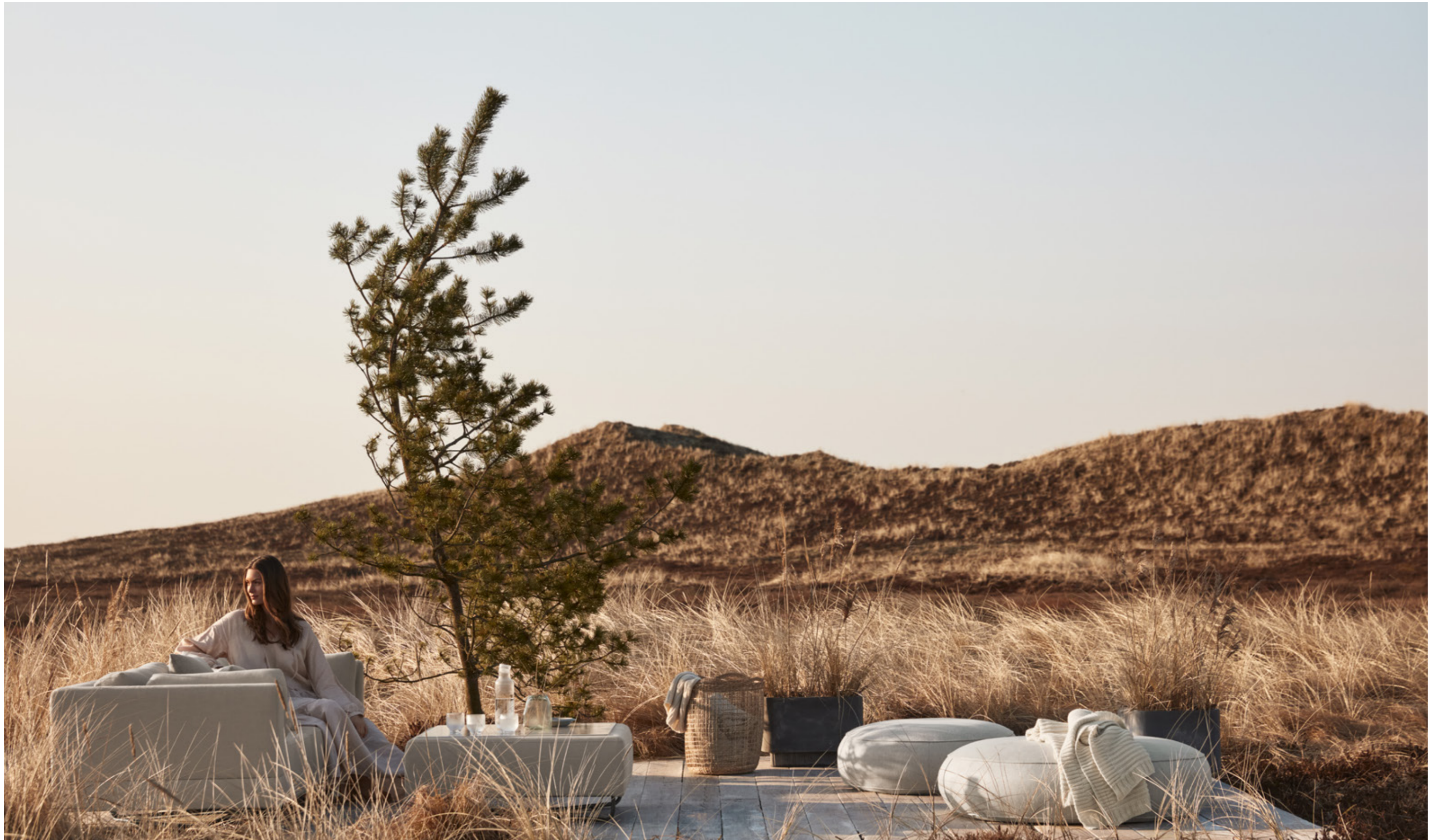
Orlando Outdoor O2 Modular Sofa. Designed by Glismand & Rüdiger . Calm Poufs in Ocean, Light Grey. Designed by Ferriani Sbolgi .