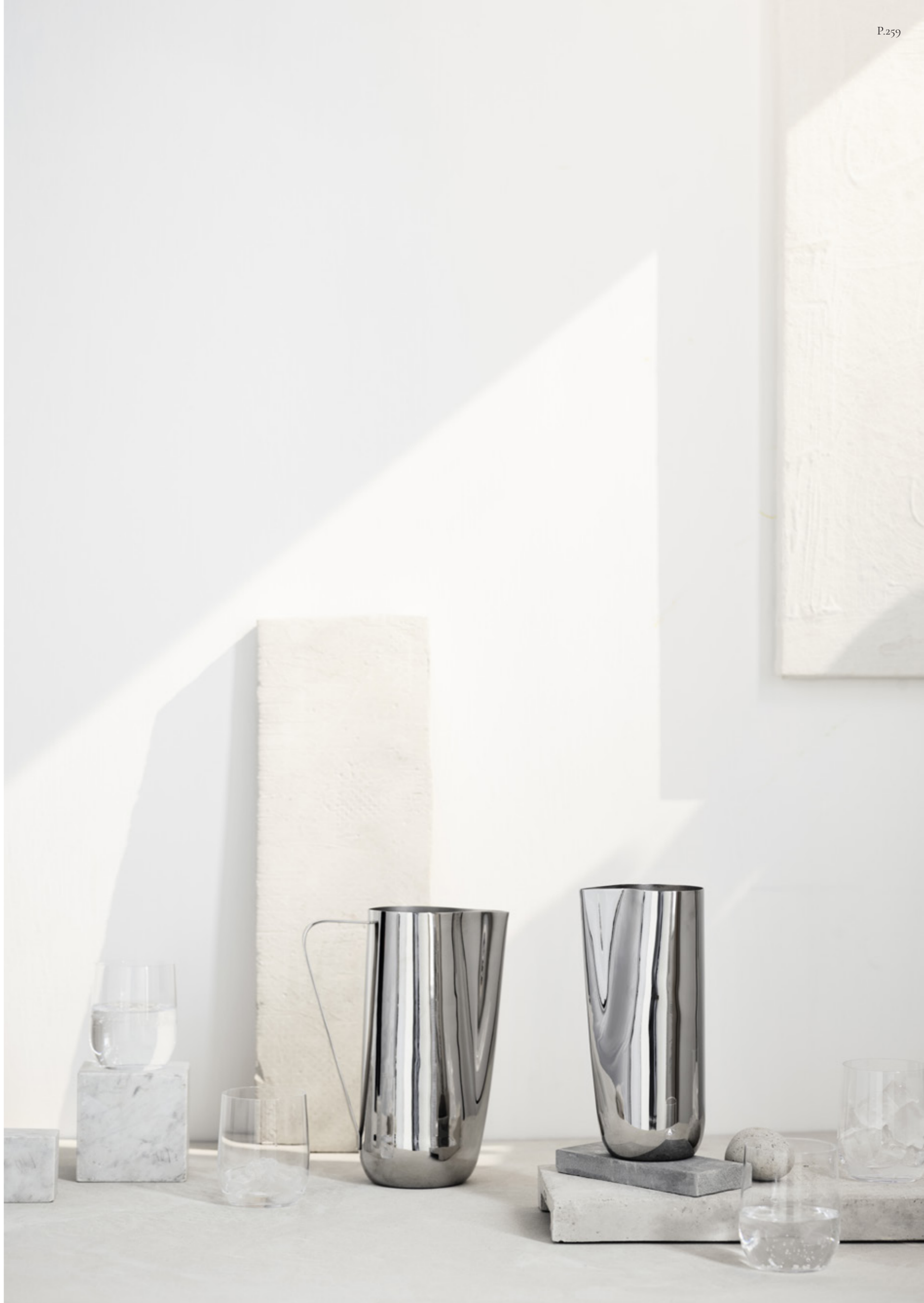
Rheolog Carafe Series. Designed by JüngerKühn.