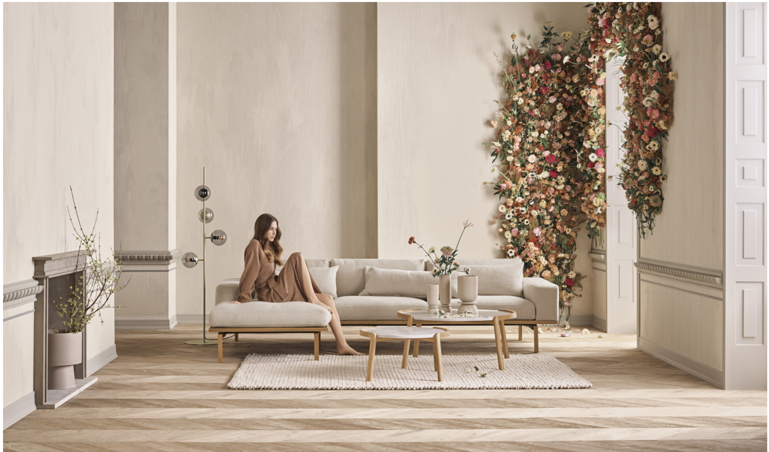
Elton 3½ seater Sofa with Chaise Longue in Ascot, Beige. Designed by Glismand & Rüdiger . Mix Coffee Tables. Designed by Studio Gud .