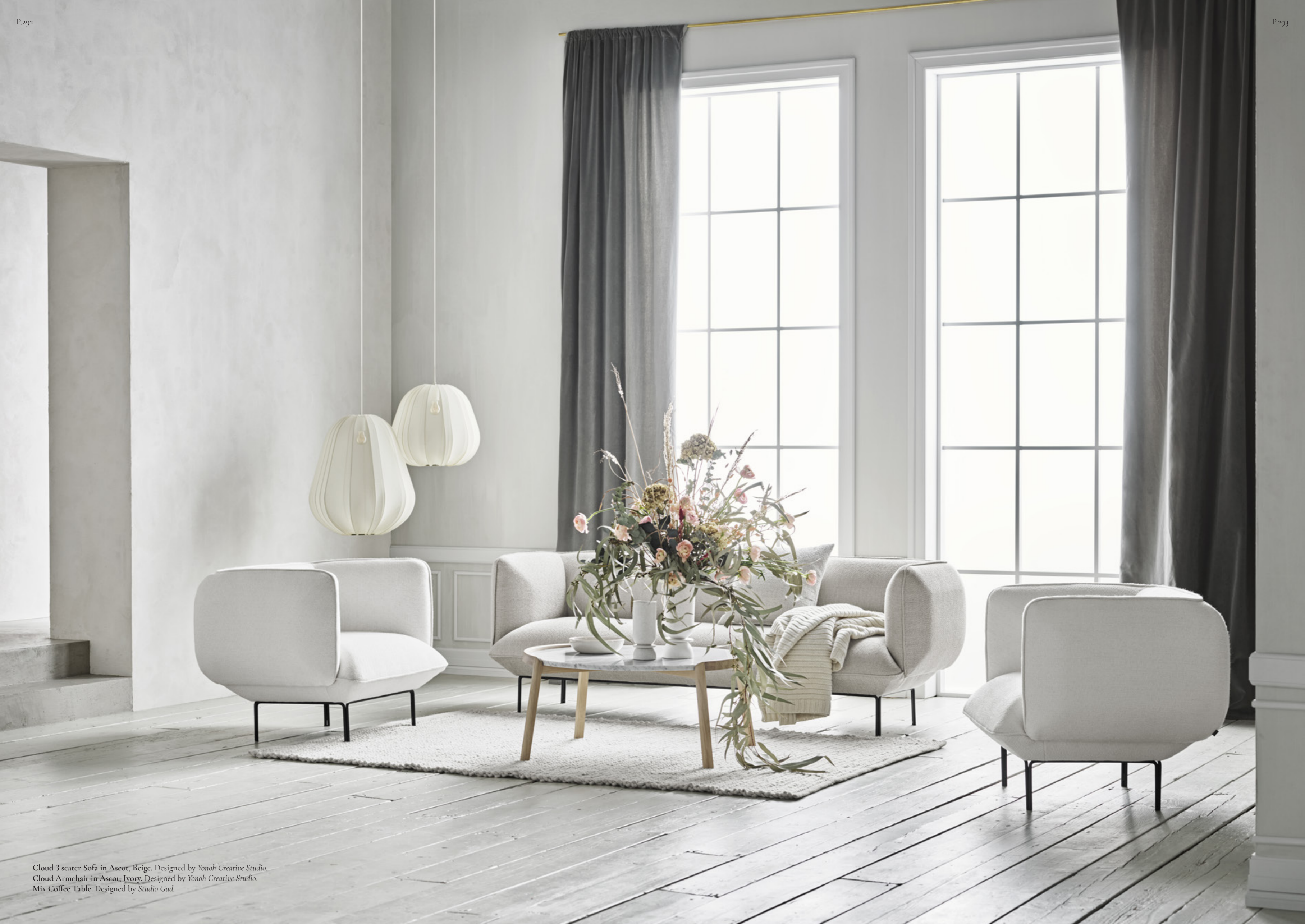
Cloud 3 seater Sofa in Ascot, Beige. Designed by Yonoh Creative Studio. Cloud Armchair in Ascot, Ivory. Designed by Yonoh Creative Studio. Mix Coffee Table. Designed by Studio Gud.