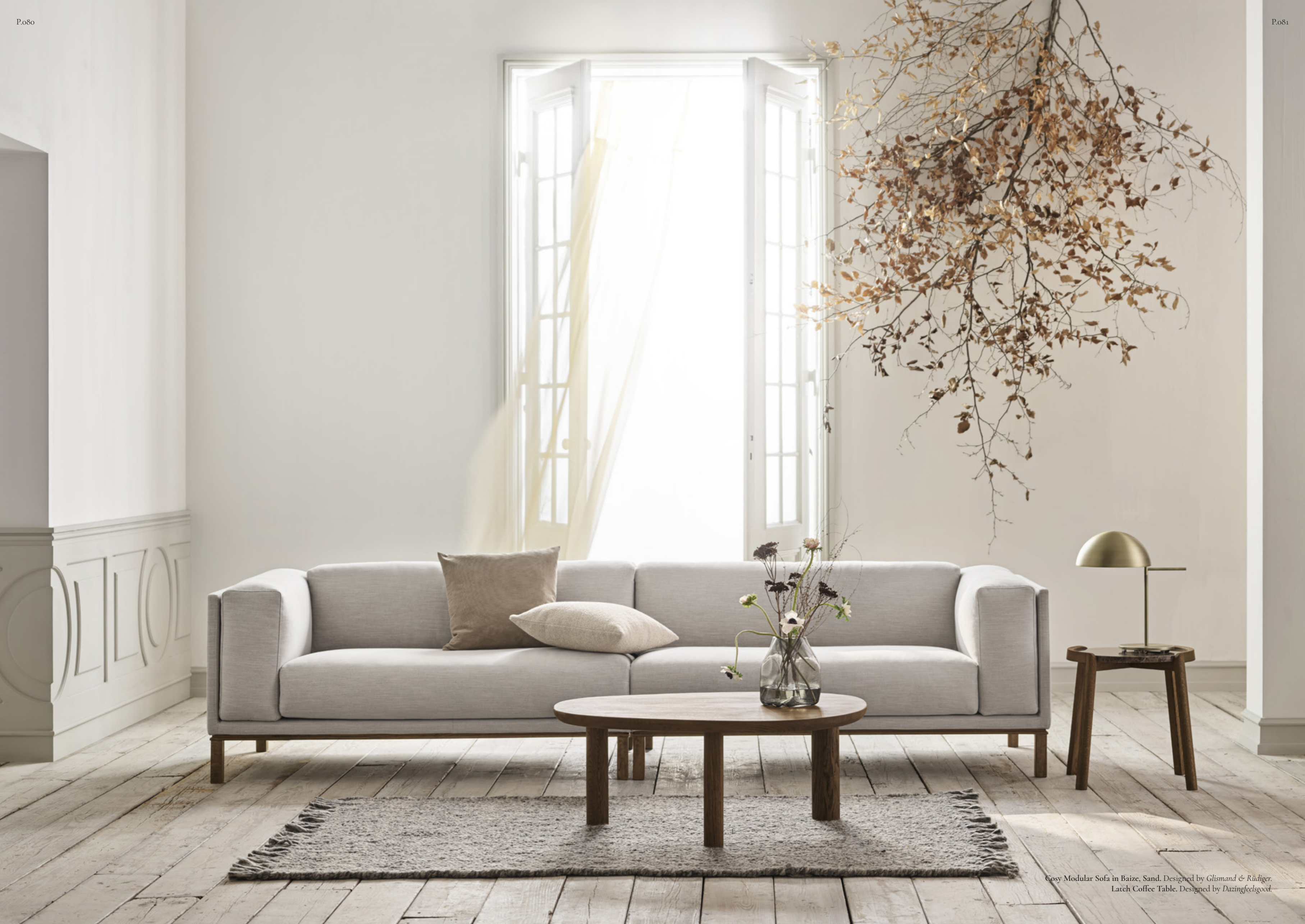
Cosy Modular Sofa in Baize, Sand. Designed by Glismand & Rüdiger. Latch Coffee Table. Designed by Dazingfeelsgood.