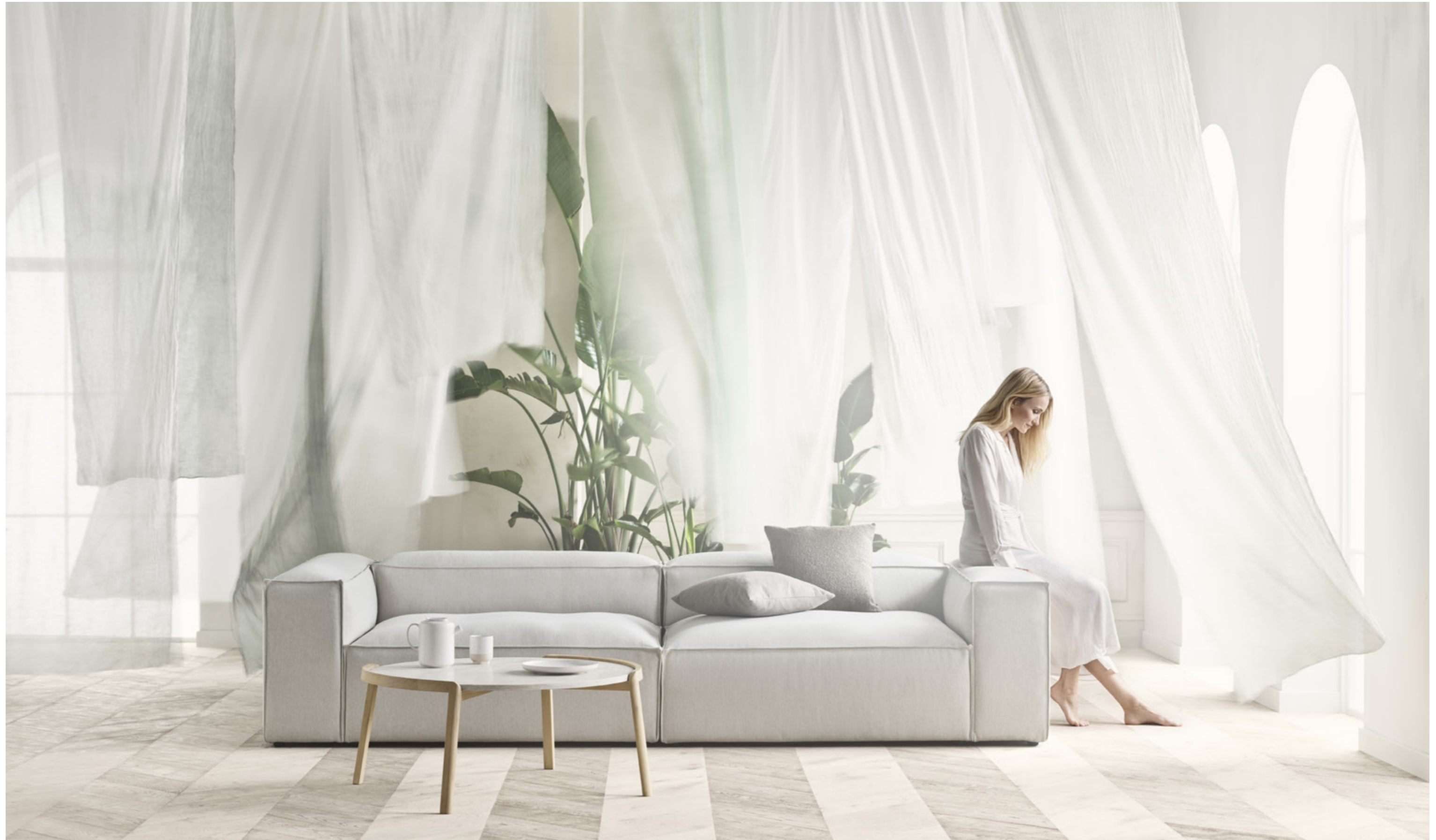
Cosima Modular Sofa in Baize, Sand. Designed by kaschkasch . Mix Coffee Table. Designed by Studio Gud .