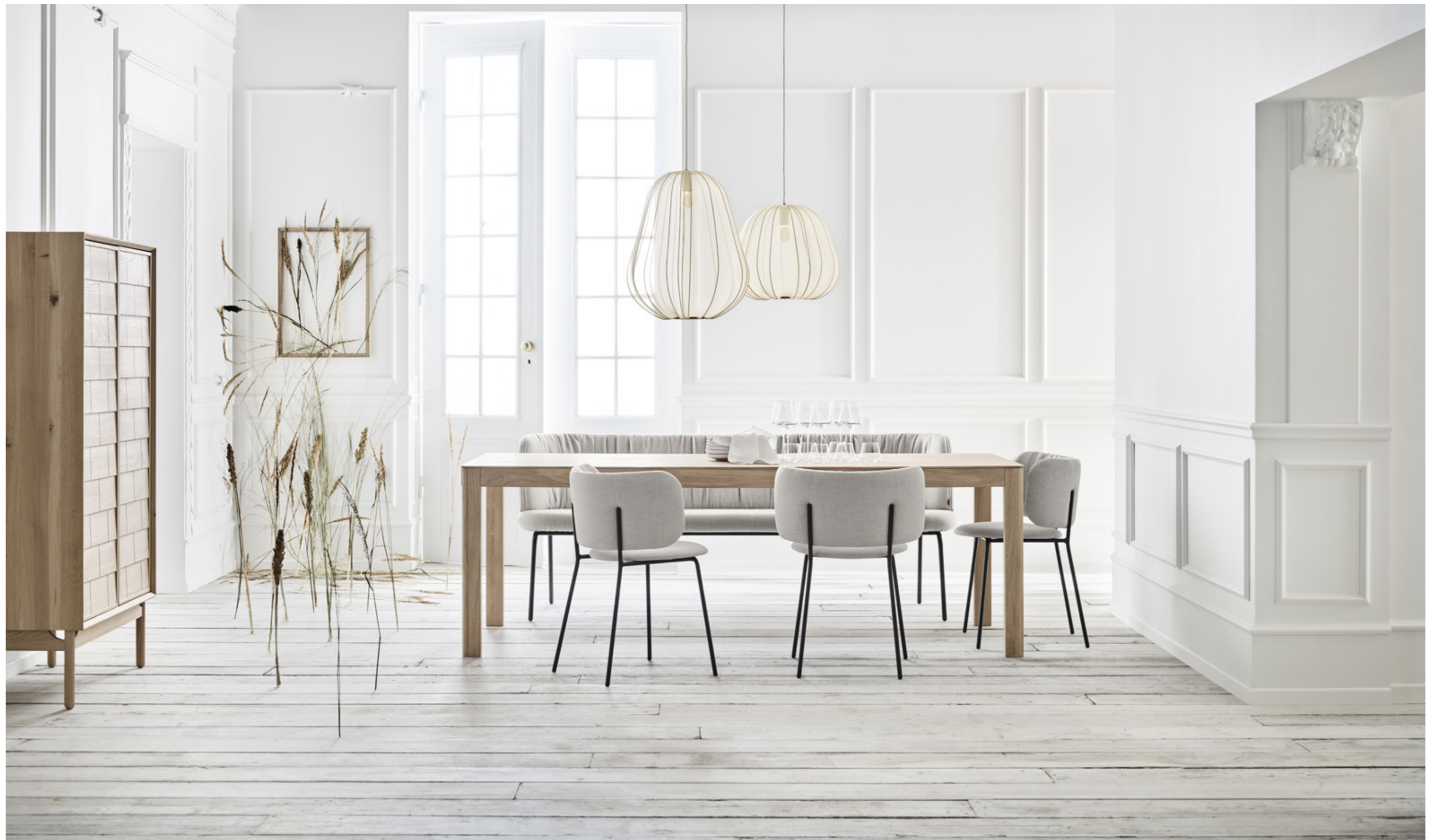
Node Dining Table, Designed by kaschkasch . Pleat Chair in Baize, Sand. Designed by Steffensen & Würtz . Pleat Dining Sofa in Baize, Sand. Designed by Steffensen & Würtz . Clinkers Highboard. Designed by OOOJA .