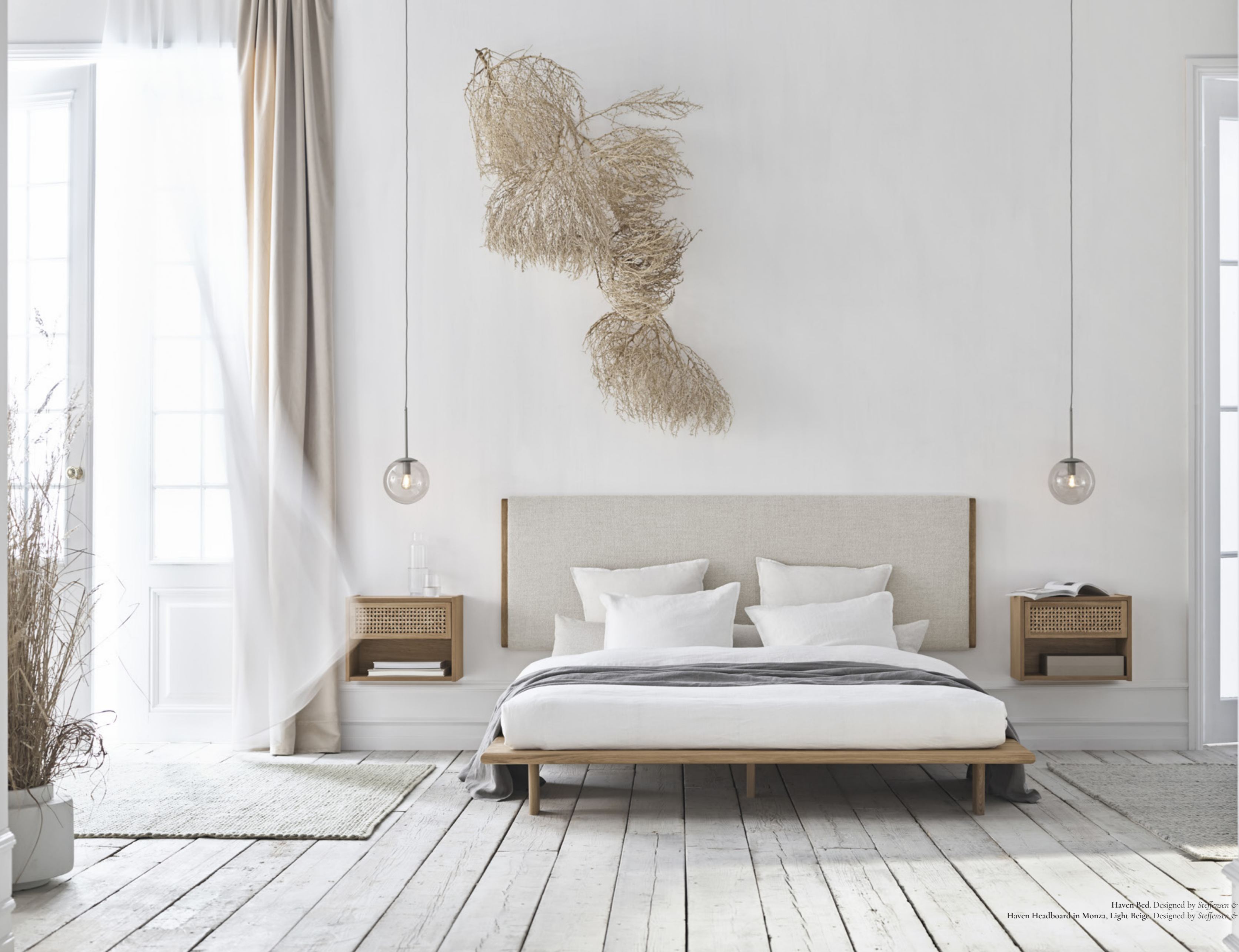
Haven Bed. Designed by Steffensen & Würtz. Haven Headboard in Monza, Light Beige. Designed by Steffensen & Würtz.