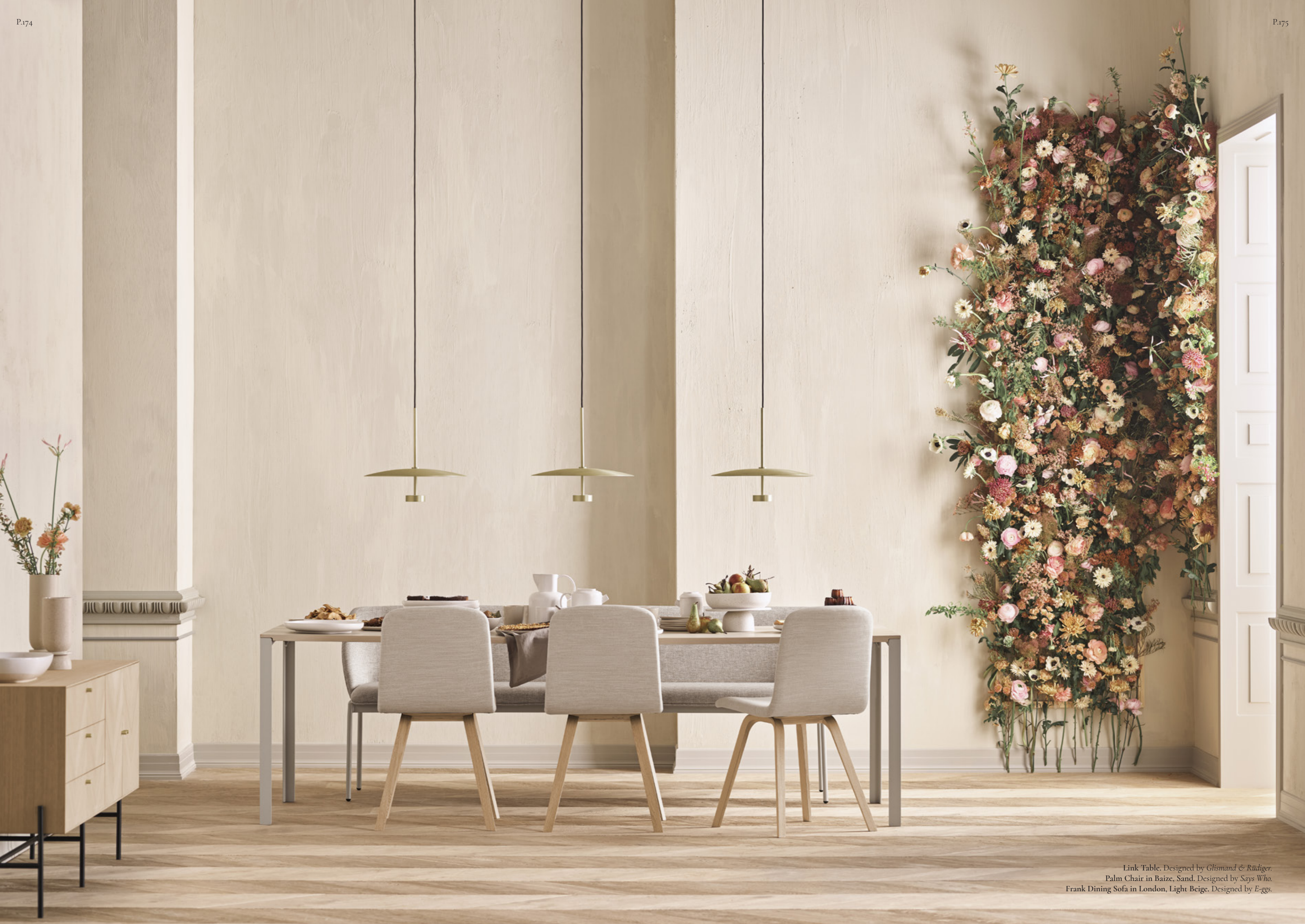
Link Table. Designed by Glismand & Rüdiger . Palm Chair in Baize, Sand. Designed by Says Who . Frank Dining Sofa in London, Light Beige. Designed by E-ggs .