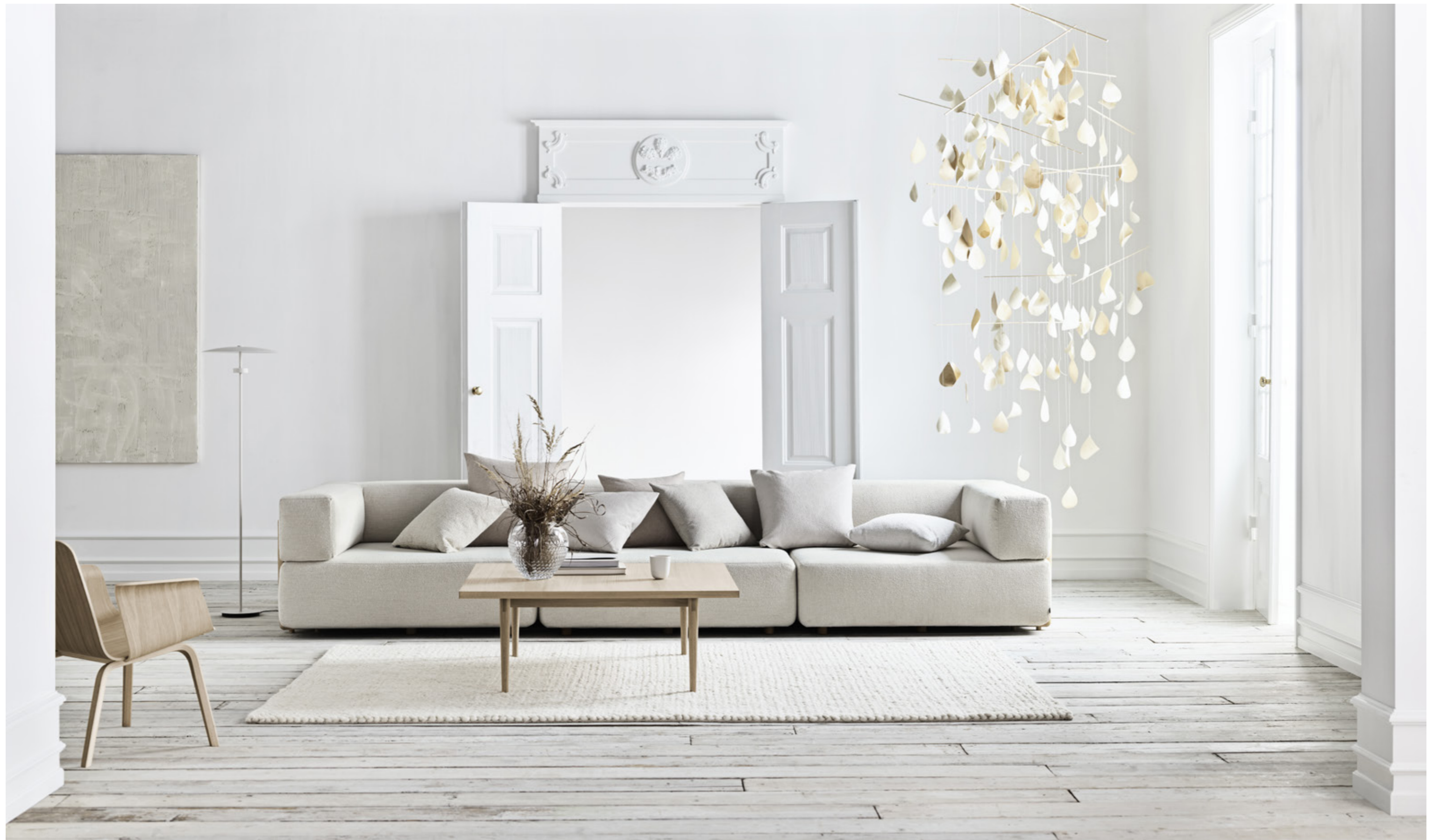
Recover sofa in Revi, Ivory. Designed by Glismand & Rüdiger . Berlin Coffee Table. Designed by Hertel & Klarhoefer . Palm Lounge Chair with armrest. Designed by Says Who .