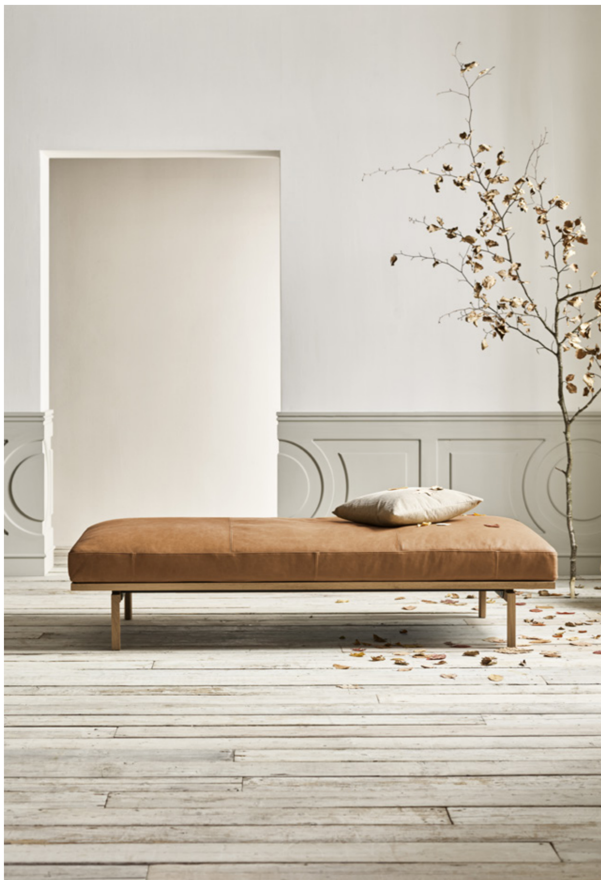
Elton Daybed. Designed by Glismand & Rüdiger.