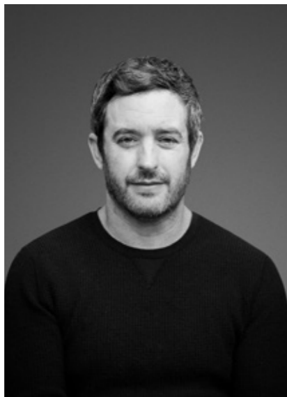
Friedman Shelving System Designed by Adam Friedman

A beautifully modular shelving system, created by the American designer, Adam Friedman. An intuitive way to organize your storage, designed in a spontaneous moment as a functional need became an aesthetic manifestation. The flexible shelving system is crafted in FSC®-certified wood and has a finely detailed, yet uncomplicated, design language that creates an inviting and flexible expression in the home. The perfect storage system for a warm, modern home.