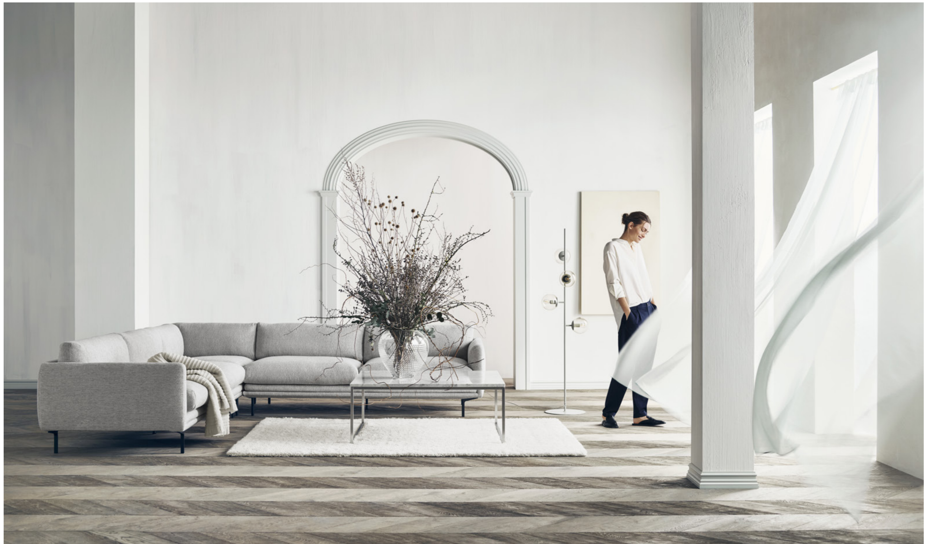
Lomi Corner Sofa in Ascot, Light Grey. Designed by Meike Harde . Como Coffee Table. Designed by Glismand & Rüdiger . Orb Floor Lamp. Designed by 365° North . Bramble Vase. Designed by Design Studio NIRUK .