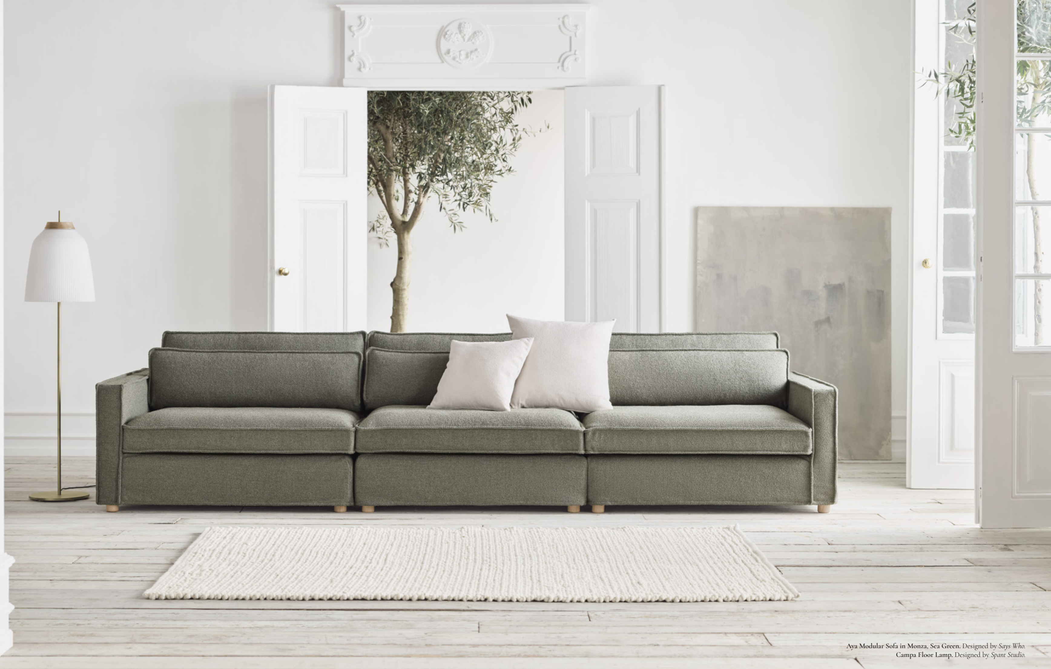
Aya Modular Sofa in Monza, Sea Green. Designed by Says Who. Campa Floor Lamp. Designed by Spant Studio.