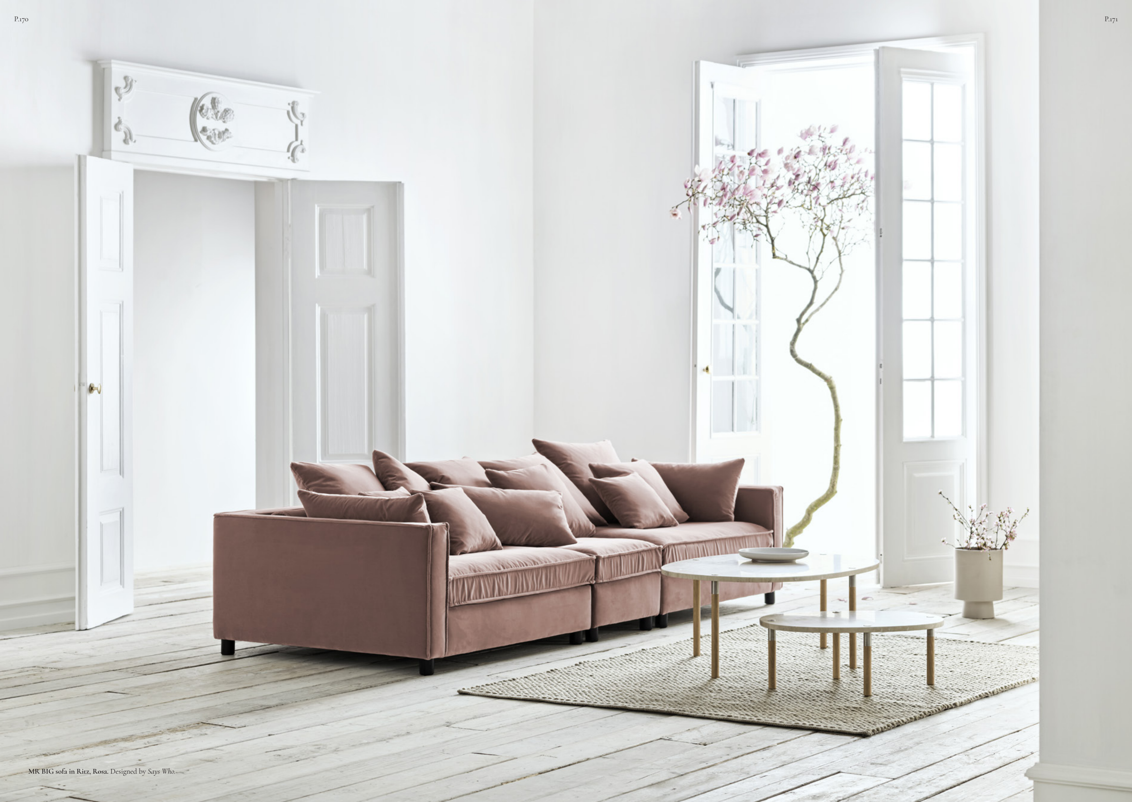
MR BIG sofa in Ritz, Rosa. Designed by Says Who.