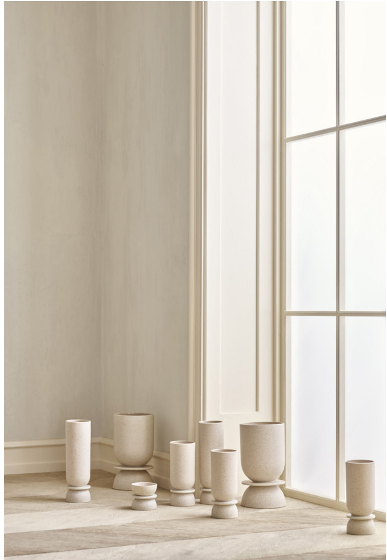
Hour Vases and Flowerpots. Designed by 201 Design Studio.