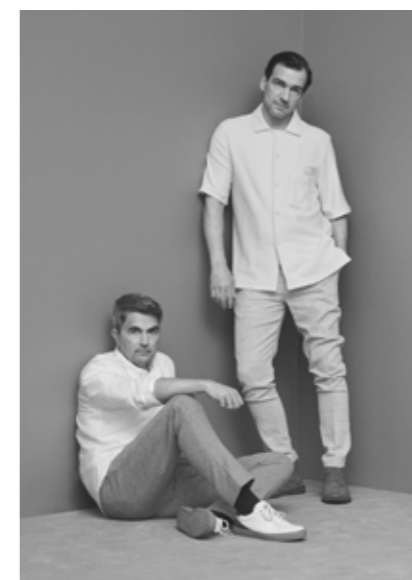
Cord Series Designed by Hertel & Klarhoefer

Cord is a series of exquisitely crafted sideboards and high boards, designed by the Berlin-based studio Hertel & Klarhoefer, and made by hand in solid oak. The designers find their inspiration mainly in the natural materiality of things, which is very evident in the Cord series, by the beautiful contrast between the solid oak frame and a delicately airy, woven cord front.