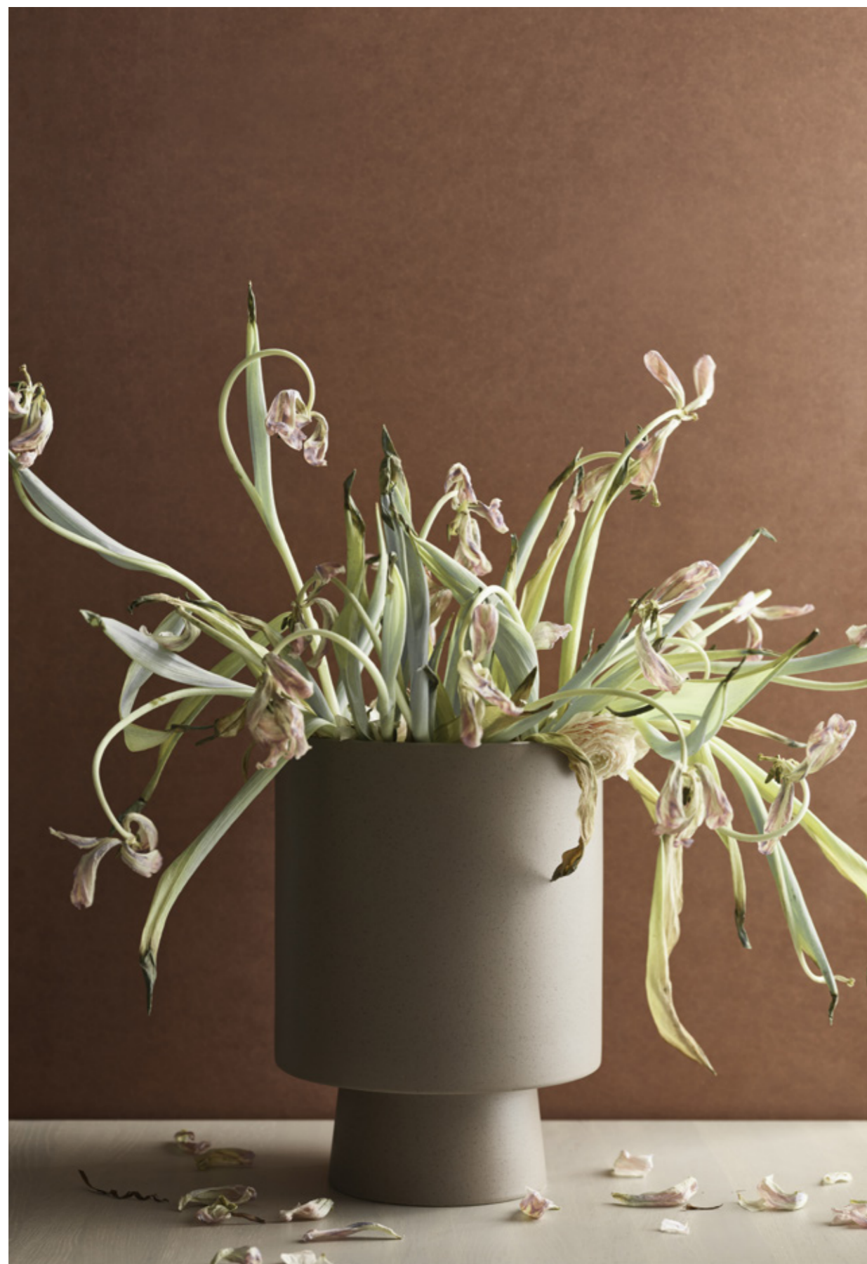
Torch Vase. Designed by Büro Famos.