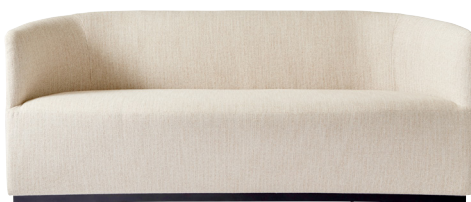
Savanna 202 9600029