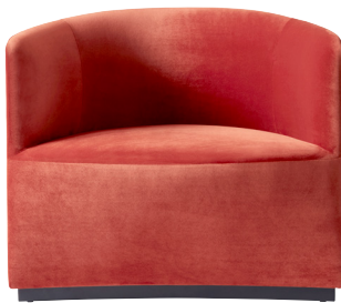
City Velvet CA7832/062