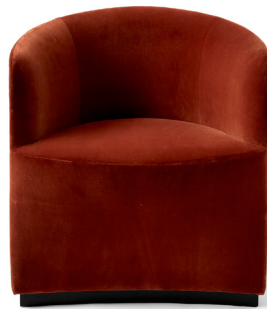
City Velvet CA7832/062