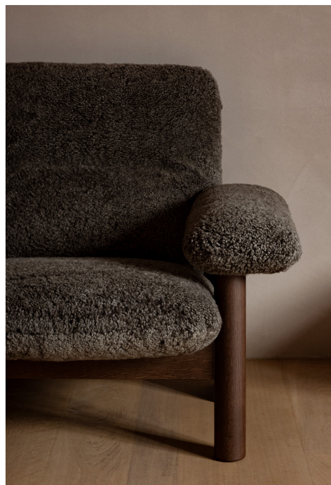
Brasilia Lounge Chair, Walnut / Sheepskin Root, by Andersen & Voll

Available in fabrics from our upholstery programme. Standard lead times apply. Custom upholstery available upon request. For further information please refer to MENU upholstery programme.