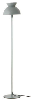
Pale Green Matt Art. No. 127715