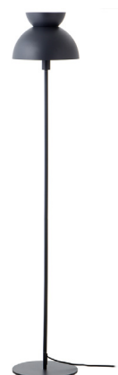
Steel Blue Matt Art. No. 127709