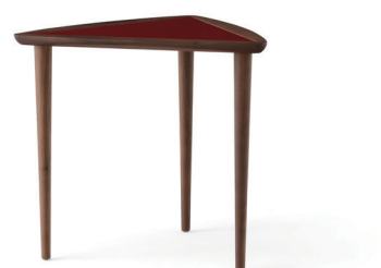
Walnut / Burgundy