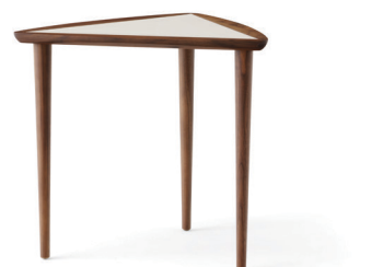
Walnut / Fog