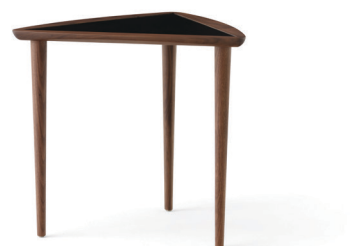
Walnut / Black