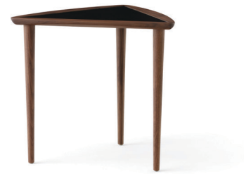
Walnut / Black