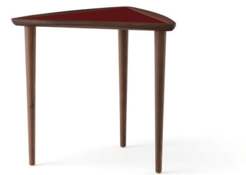
Walnut / Burgundy