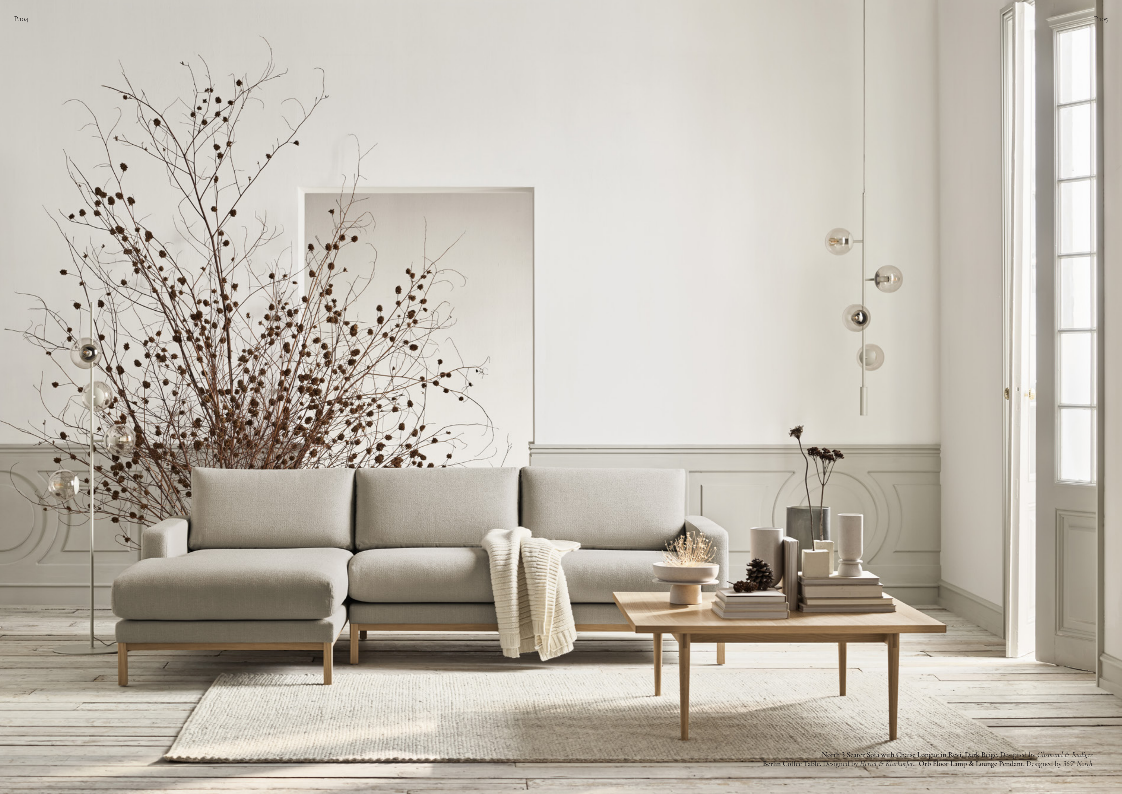
North 3 Seater Sofa with Chaise Longue in Revi, Dark Beige. Designed by Glismann & Rüdiger. Berlin Coffee Table. Designed by Hertel & Klarhoefer. Orb Floor Lamp & Lounge Pendant. Designed by 365° North.