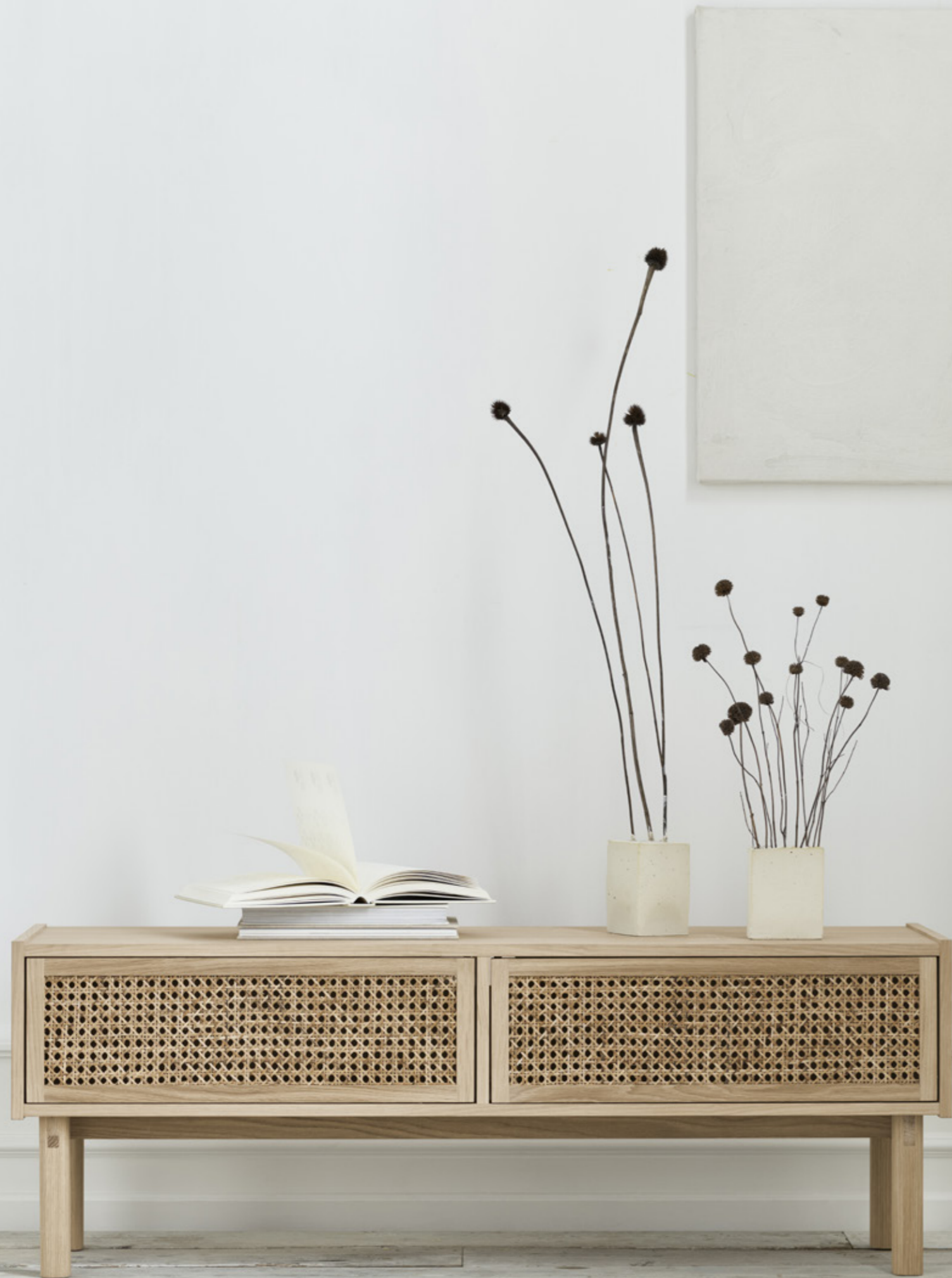
Cana Storage Series Designed by Steffensen & Würtz

Every design in the Cana series is made in beautiful, FSC®-certified oak with a distinctive detail of intricate wicker decorating the drawers. The combination of the two naturally tactile materials brings out an iconic, bright and calm appearance for showing off all your favourite things. Either in plain sight behind the glass doors or slightly hidden away behind the airy wicker fronts.