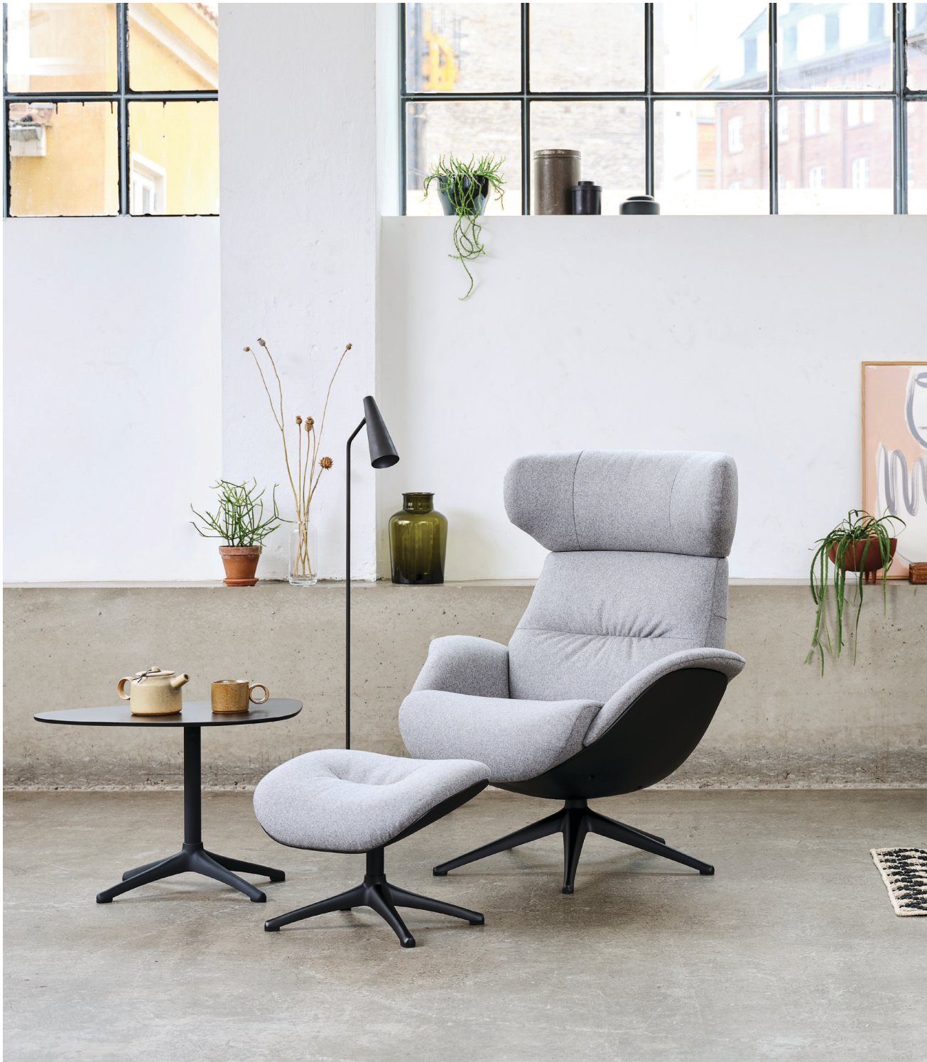
Model shown: More, Super Soft Wool 2310 Flint Grey, Composit Shell Cosmic Black and black legs with footrest