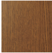
LIGHT SMOKED OAK