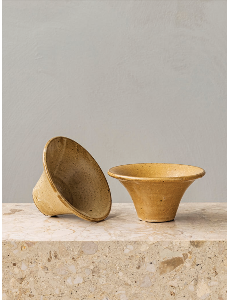
TRIPTYCH BOWL Designed by Mentze Ottenstein