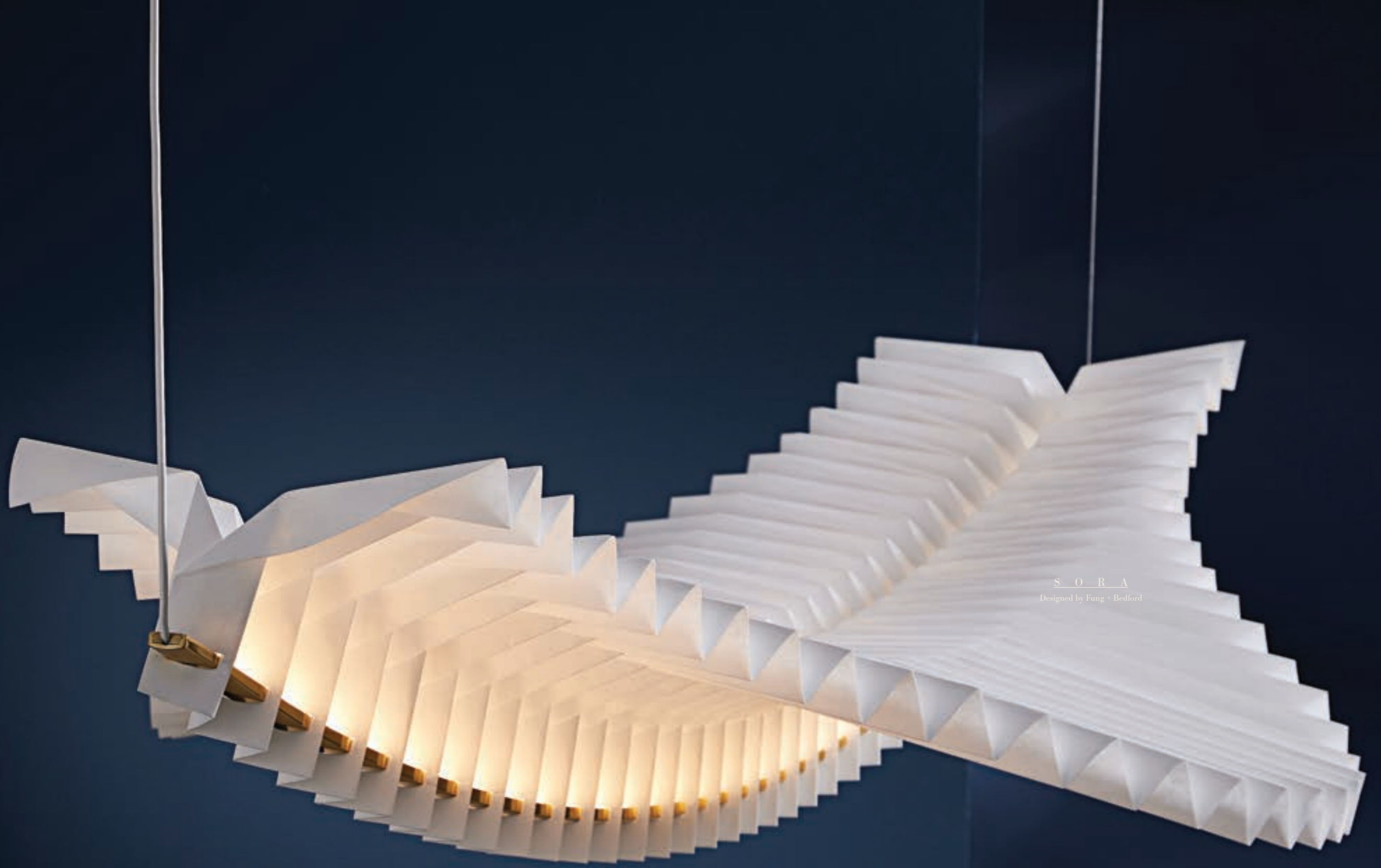
S O R A Designed by Fung + Bedford