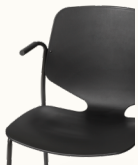
w/o upholstered seat