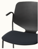
w/ upholstered seat

Nova Sea Sidechair is characterised by its light elegant shape and metal frames. A sustainable chair reimagined in ocean plastic waste, supporting innovative solutions preventing pollution of the world's oceans. Nova Sea Sidechair is designed for disassembly, meaning that the design allows each component in its purest form to recycle into new production circles. Durable for both private and public use.