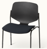
w/ upholstered seat

Nova Sea Sidechair is characterised by its light elegant shape and metal frames. A sustainable chair reimagined in ocean plastic waste, supporting innovative solutions preventing pollution of the world's oceans. Nova Sea Sidechair is designed for disassembly, meaning that the design allows each component in its purest form to recycle into new production circles. Durable for both private and public use.