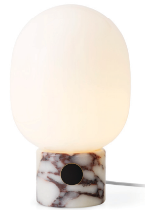
Calacatta Viola Marble 1830319