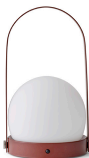
Burned Red 4863349