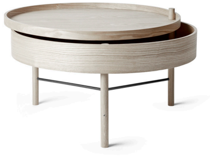
White Oak/Black Chrome 6900049