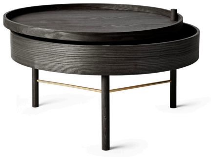
Black Ash/Brass 6900539