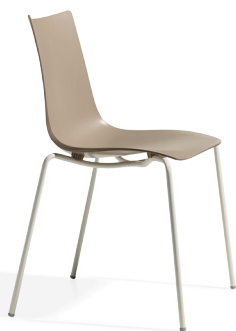
2615 VL 15